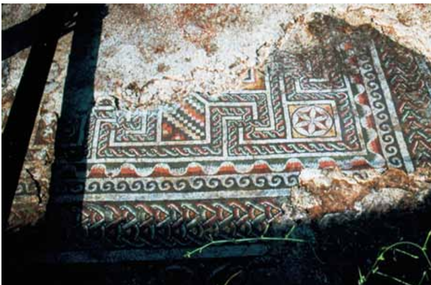
Figure 4 South Panel

Description: The main composition consists of swastika maeanders and small squares around a big central square (Figure 4). Panel has a grid of maeander