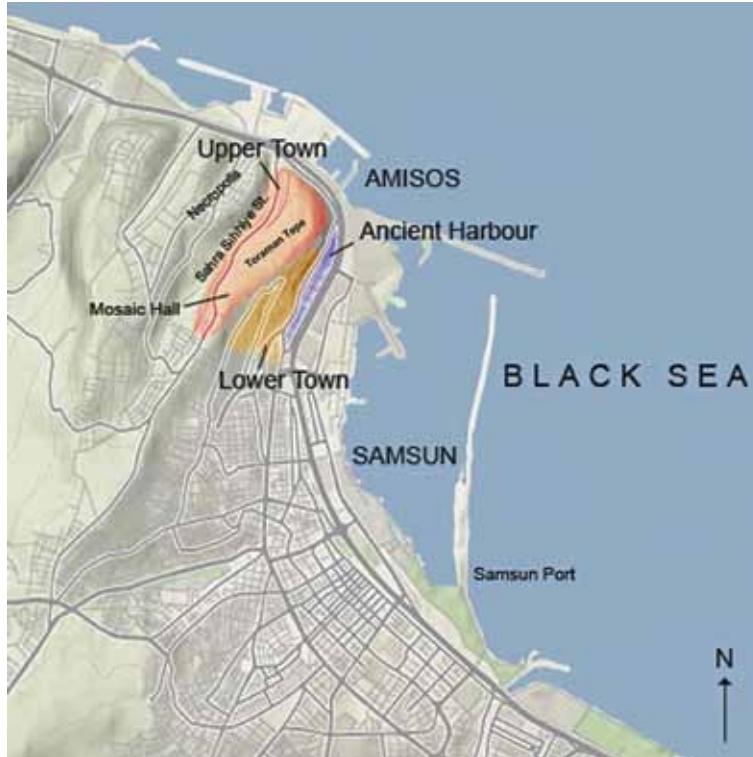
Figure 1 Map of the modern Samsun and ancient city of Amisos (It is arranged by combining the map data from Google and utilized with Atasoy 1997)

a resource for the samples that were located at Sıhhiye Okulu. However, Amisos mosaics dated back to the first half of the 3 rd century A.D. display superior qualities and crafting properties from the mosaic of Sıhhiye Okulu.