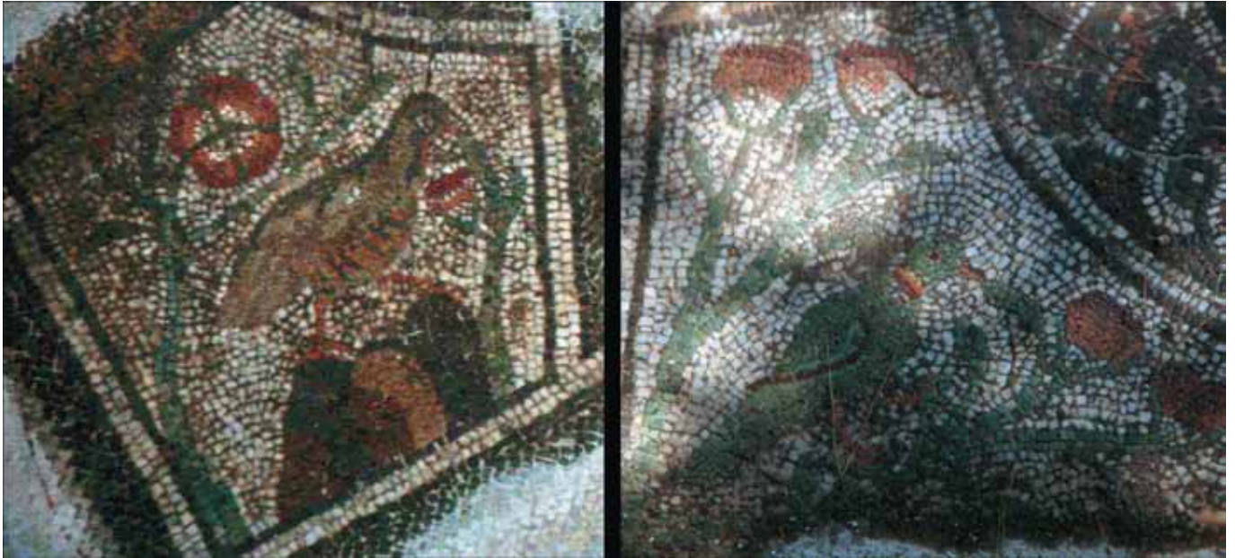
Figure 8 Figures of partridge and dove

along with letters “A” and “P” are supposed to symbolize spring time 3 . This explanation reminds about the four seasons theme, just like in Amisos Mosaic. An illustration with short brown hair, pearl diadem and outfit is depicted in a serious expression. The tesserae used on the hair, eyes and face of the illustration in different tones give a spirit to the scene (Figure 7). The interspaces between the illustration and concave corners are filled with fruit (?) and flower patterns. However, it was not possible to work on the oncoming parts of the mosaic and observe the well-preserved part. Therefore, the information is limited about the mosaic pavement which is thought to be taking up a larger space.