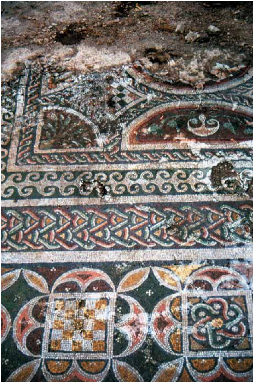
Figure 5 Detail of North Panel

consisting of three bands. Two white bands of 0.05 m width contain 0.23 m wide double wave crest patterns. The main border is a band of superposed involuted linear hearts, forming wave-pattern (Décor I: 94c). Double wave crest motifs are ornamented in white color on black background.