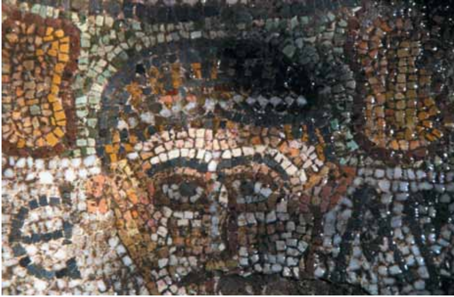
Figure 7 Inscribed portrait of a male