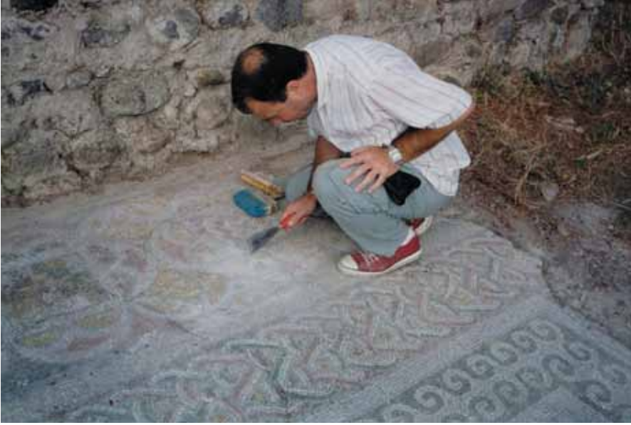
Figure 9 A view of conservation procedure