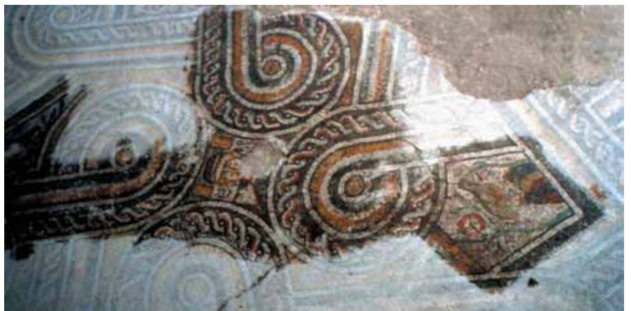
Figure 6 Panel with Figure

Coils consist of tobacco and dark blue colored guilloches along with yellow and black colored straight bands. On one of the shapes in the center where four coils meet, a male portrait stands out. The letter “E” at one side of the head