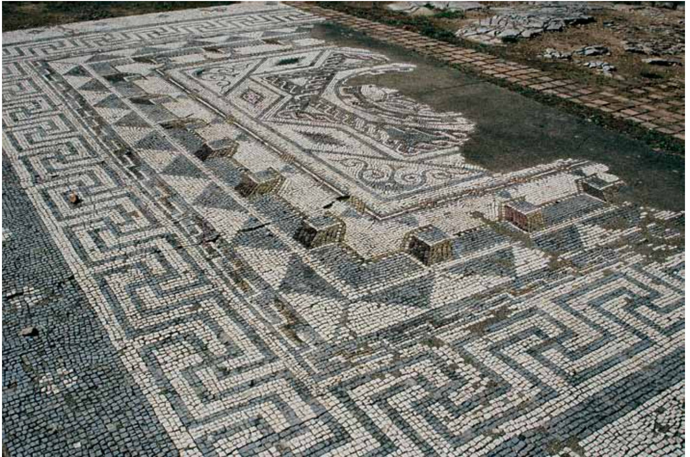
Figure 10 Mosaic pavement proceeding from Conimbriga (unknown origin).

To propose a reliable dating for the mosaic from Bracara Augusta , important archaeological data are missing out. However, the stylistic analysis and some comparisons found, either inside or outside the Portuguese territory, it appears that overall, these achievements point to 3 rd and 4 th centuries A.D. Considering that Bracara Augusta these centuries had a significant phase of constructive development as capital of Gallaecia (Martins et al. 2012: 57), we suggest this timeline to complete this mosaic.