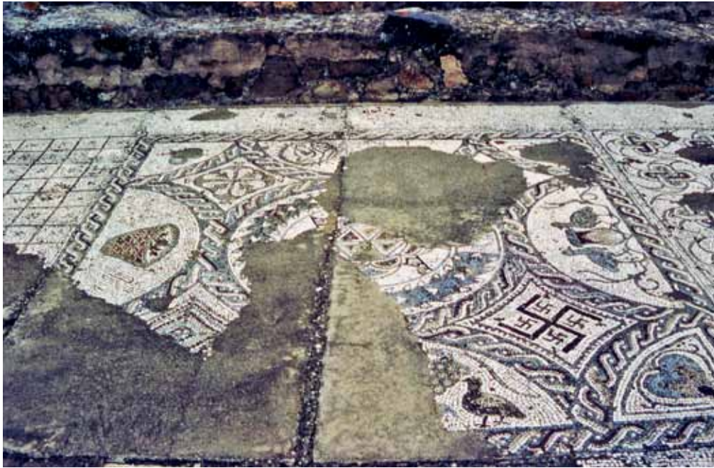
Figure 2 Mosaic panel from a room of the Villa of Pisões, Beja, Portugal.