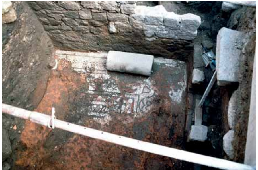
Figure 5 Mosaic fragment from “Casa da Roda”, Braga.

This mosaic, unpublished, is first noted by Abraços 2005: 218-219. The author indicates that it was found in 1990, in the so called «Casa da Roda», Rua de S. João, in Braga. The tessellatum , with original support, in breakdown, was cleaned and consolidated, leaving the mosaic in situ , covered. From six photographs, the author referrers have made a montage and a drawing from the decal on the photographs. Dom Diogo de Sousa Museum of Braga registered this mosaic with the inventory number: 2003.0515 (Fig. 5) 11 .