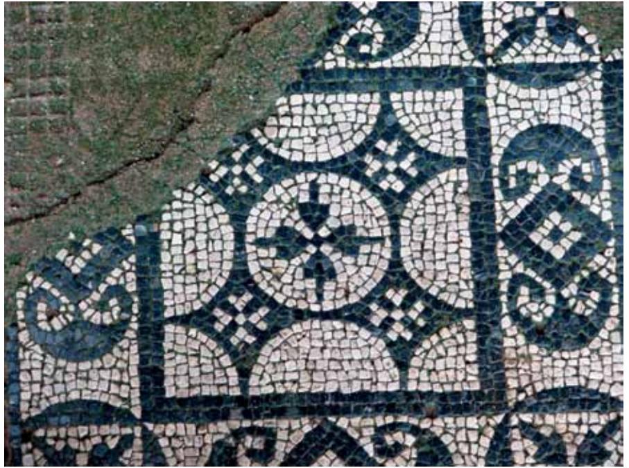
Figure 1 Detail of the peristylum mosaic from “Casa del Mitreo”, Mérida, with the «compass drawing schema» filling a square.

As regards the Western provinces of Hispania ( Tarraconensis , Baetica and Lusitania ) the earliest examples of floors with this compositional schema date from the 2 nd century A.D. 6 . In the capital of Lusitania , colonia Augusta Emerita , we found this schema curiously used in filling up small squares as in the peristylum mosaic of the so called «Casa del Mitreo» (Fernandez-Galiano 1980: 45) (Fig. 1), dated from the end of the 2 nd century A.D. (CME I: 39-40, n° 21, láms. 44 b and 45 a (mosaic from the 2 nd century A.D.). Id. Ib. Introduction: 15-16). It seems rare use since this schema is usually used in relatively large panels inserted in the decoration of all floor or even covering the entire mosaic pavement. Such is the case of the mosaic also proceeding from the capital of Lusitania , signed by Seleucus and Anthus 7 , mosaicists names pointing to the Hellenistic East, particularly to Syria as the name Seleucus 8 .