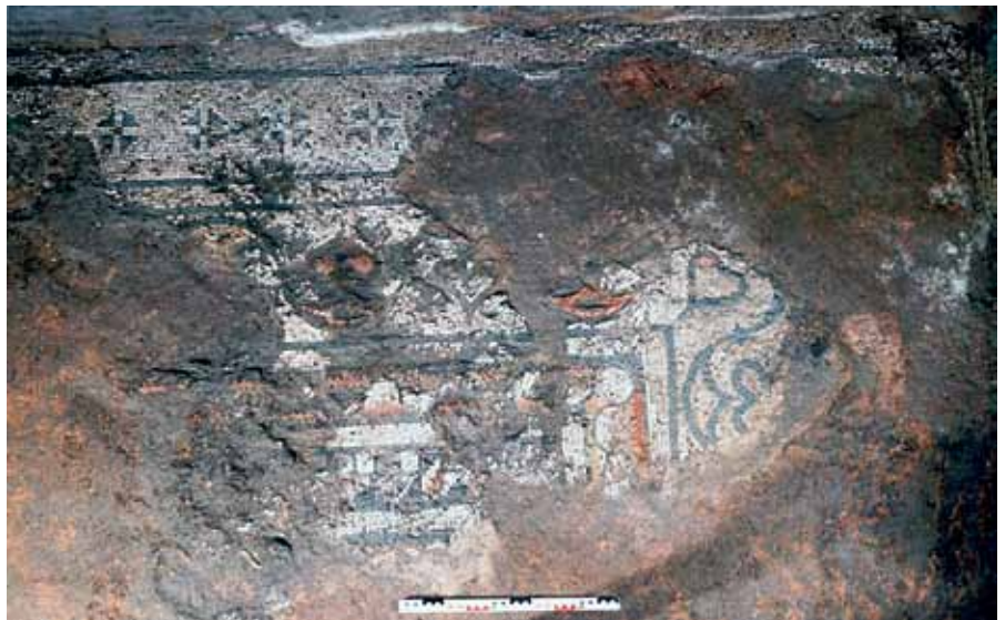
Figure 6 General view of the mosaic from Bracara Augusta .

An «undulating row of alternately inverted peltae , outlined, the peltae with a heart on the central point» (Décor I 58e, polychrome variety) (Fig. 6).