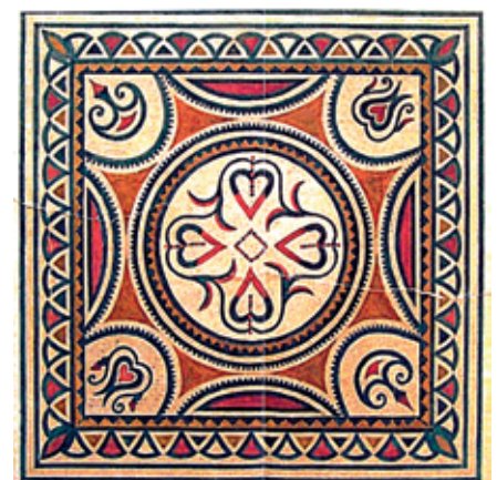
Figure 4 Drawing of the mosaic pavement J, N° 3-B from the Villa of Boca do Rio, Budens, Vila do Bispo. Apud Veiga 1910 [2006].