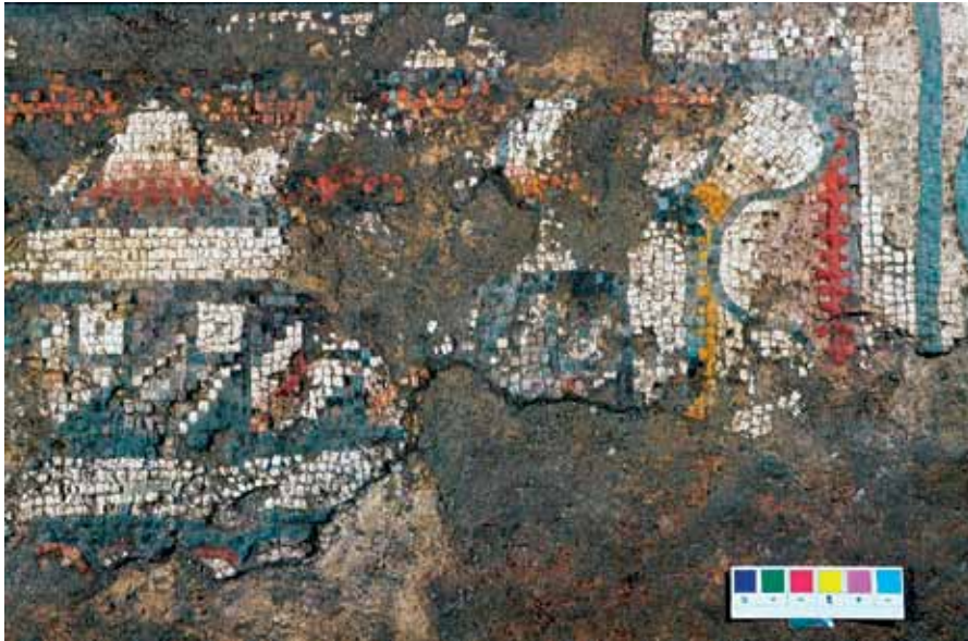
Figure 9 Detail of the three-dimensional decoration on the Bracara Augusta mosaic.

The plastic cubes as a pattern appear on mosaic pavements from the 2 nd century B.C. onwards (Ovadia 1980: 160, 55 K3). In the «Casa dei Grifi», Rome, Palatine, 100 B.C., a panel in opus sectile and the low part of the mural painting are associated by the same decoration: three-dimensional parallelepipeds. At Pompeii, the oldest example of that sort of painting comes from the 1 st Style (Barbet 1985: 29-30 fig. 18: «Casa dei Grifi», central cubiculum , n° II; fig. 17: Pompeii, house VI, 16, 26).