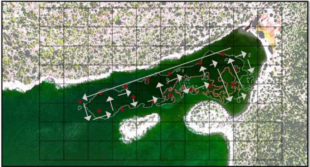
Fig. 2. Markers and study plan

marking procedure, scientific divers continuously performed dives in transects, and recorded the meadows from the same distance to the bottom by using a 2 m long string and weight, attached under the camera system and barely touching the bottom while filming. All gathered information on the distribution and coverage of P. oceanica meadows were integrated in ArcGIS platform (Figure 2).