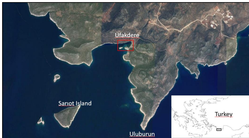
Fig.1. Study area

Substrate consists of sandy bottom between depths of 20 and 30 m and mix substrate of sand and rocky bottom at shallower depths (0 - 18 m) in inner parts of Ufakdere Cove. There is a high flow freshwater input, which is known as "Altug Cave", at a depth of 11 m at the eastern end of Coban Cape. Majority of the meadows are found between 18 and 30 m. Inner part of the cove ends with a pebble beach, with a muddy sandy substrate due to a creek discharging to the bay.