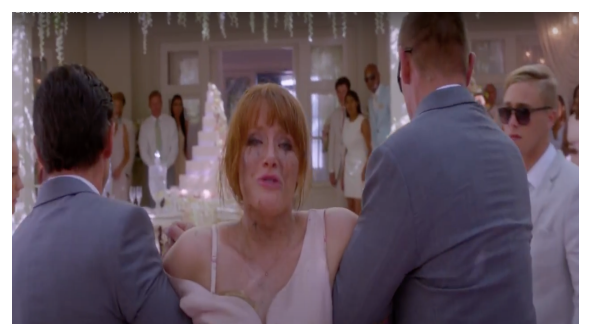
Visual 9. Bottoming out

ironic. Because Lacie is discontent throughout the episode and is unaware that feeling content is not a status to be attained as a result of something.