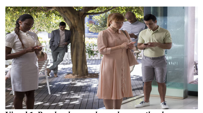
Visual 1. People who are always busy on the phone

Visual 1, shows the scene, which is a kind of summary of the episode, and the people who are constantly busy with their phone screens. The episode's title "nosedive" is used in the sense of "sudden fall" or "hitting rock bottom". Individuals in a highly digitalized society have access to the name of the person in front of them and the score information that determines their social status, thanks to eye implants. The antagonist of the