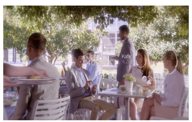
Visual 4. People's scores

does not swallow the cookie. The other scene is one in which she prepares a delicious olive tapenade (which she never eats) for her account. These scenes remind the perpetually cool lives shared on social media today. Many similar scenes in the episode demonstrate people living in the hyperreality of the postmodern era. These people's interactions with one another are staged and superficial. During their encounters, a forced grin spreads across their faces, far from being genuine. These people, who appear to be happy and walk around with fake smiles as if they really like each other, raise each other's ratings by being concerned with their own scores.