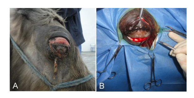
Figure 1. A) Clinical appearance of the right eye. B) Intraoperative appearance of the right eye. Şekil 1. A) Sağ gözün klinik görünümü B) Sağ gözün intraoperatif görünümü.

Following anesthesia, the bulbus oculi and relevant paraorbital tissues are removed, during which multiple growths in paraocular and paraorbital regions were also noted. The skin incision was closed with a single layer of simple interrupted sutures with 0 silk, leaving a small opening medially for the gauze drain. Postoperatively, sodium ceftiofur (Excenel®-Pfizer) in 1 mg/kg/day IM doses for 7 days, and flunixin meglumine (Fulimed®-Alke) in 2.2 mg/kg IM doses for 5 days are administered. During the postoperative controls of the patient at week 3 and 6, it was observed that the sutures under the eyelids of the subject were removed naturally, and that the overall condition of the patient was well.