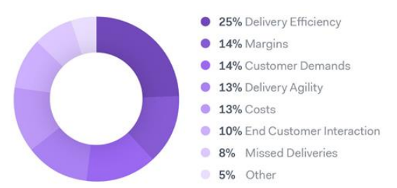
Figure 1 Bigges Last Mile Challenge [21]

factors in instant delivery such as flexible time window, pay-to-order mechanism, time required for seller to prepare goods before delivery, and delivery consolidation. In the developed model, a multi-objective optimization framework based on customer's total cost function and time satisfaction was created. Double layer chromosome coding based on supplier-tonode mapping and access order was performed and non-dominant sequencing genetic algorithm version II (NSGA-II) was used to solve the problem. According to the numerical results, when the customer's time satisfaction is taken into account in the instant delivery routing problem, customer satisfaction has increased effectively and the balance between customer satisfaction and delivery cost has been achieved by Pareto optimization [20].