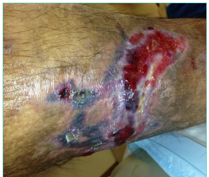
Figure 7. 9 weeks