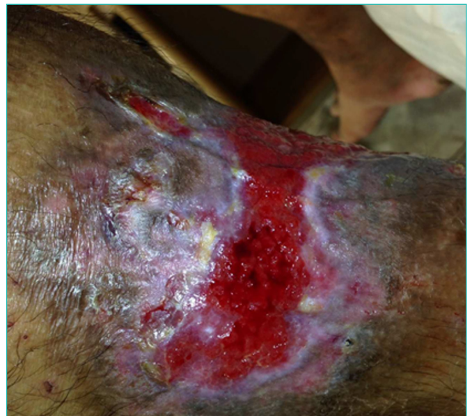
Figure 6. 6 weeks