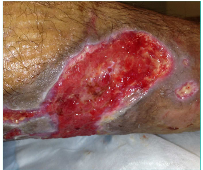
Figure 5. 1 week after FBADM application

41 y/o male with type 2 DM, morbid obesity, (Body Mass Index:38), presents with multiple wounds on both legs. Wounds have been present for the past 5 months. The patient has never received wound care but dry dressings. We decided to apply FBADM to the largest wound which located on left leg posterior which is filled with fibrotic tissue without any granulation, measured as 6.5cm x 11.5 cm x 0.4 cm with an area of 58.7 cm 2 (Figure 4). At one week after application (Figure 5) there was significant improvement in wound bed quality, healthy granulation, partially integrated FBADM and advancing epithelium at wound edges. Figure 6 (6 weeks) and Figure 7 (9 weeks) show rapid spontaneous epithelium advancing over wound bed from all edges. Patient had sporadic follow up due to personal issues he self reported the wound has healed approximately after 16 weeks. He applied to the wound care center after 24 weeks, the wound was totally healed with immature but intact epithelium (Figure 8). At 28 weeks wound was with mature epithelium, good quality healed skin (Figure 9).