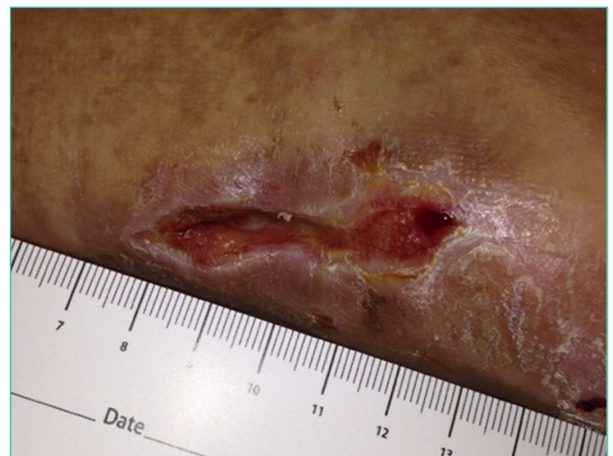
Figure 2. 8 weeks after FBADM application