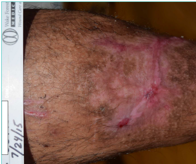
Figure 9. 28 weeks

Sharp debridement was performed and FBADM was applied along with four layer compression bandage. Wound area has reduced to 25.7 cm 2 and 0.2 cm 2 at week 4 and week 12 respectively without any complication.