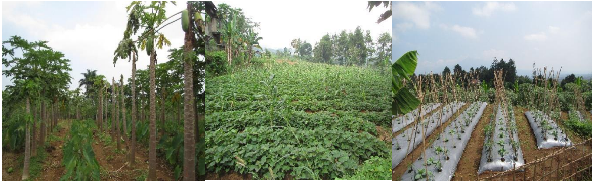
Figure 1. Agricultural landscape condition of upstream Ciliwung watershed