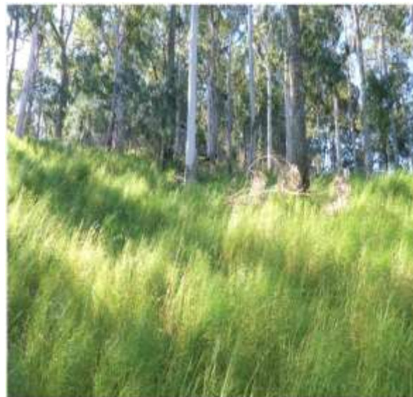
Figure 1. Frequently burnt eucalypt forest in Queensland (Australia), dominated by kangaroo grass ( Themeda triandra ) (Williams et al., 2022).

species, and as a vegetation filter, some authors identify it as synonymous with Australian T. triandra . It is a member of the Poaceae family with a very high protein content. It is an important feed source for cattle and wildlife, particularly in Africa and other dry grasslands (Dell'Acqua et al., 2013) (Figure 1).