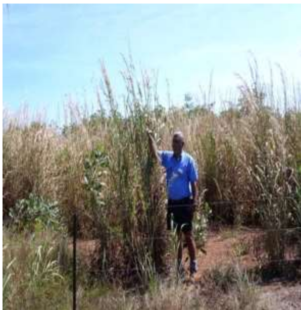
Figure 2. Clumps of mature flowering plants of gamba grass ( Andropogon gayanus ) showing a tussocky growth habit (Bebawi et al., 2018).

Akinyemi et al. (2021) studied the genetic diversity of 9 different Andropogon spp. obtained from Ogun State using four microsatellite markers (Xcup63, Phil227562, Xcup14 and CTM59). Using the DNA extraction method of Zymo spin™ technology, genomic DNA was isolated from the succulent leaf portion of Andropogon grass. Each and every locus-population is in Hardy-Weinberg equilibrium. At every locus, there were fewer viable alleles than noted alleles. For all markers of the grass taken into consideration, the determined heterozygosity was higher than expected.