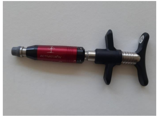
Figure 2. Activator device

was applied as chiropractic spinal manipulation.<sup>29</sup> Individuals were informed about the activator device (Figure 2) and the activator basic screening protocol. Chiropractic manipulation practices were performed by a physiotherapist with a master's degree in chiropractic.