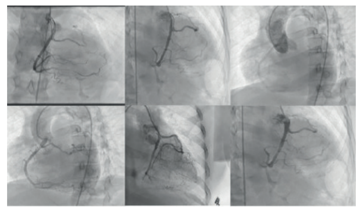
Figure 3. Coronary angiography image (LMCA agenesis Absence of LAD, RCA and CX originate from the same ostium)

Although coronary anomalies are usually innocent, they have been shown to cause sudden cardiac deaths, although rarely. Many anomalies are found incidentally in coronary angiography and autopsies (12). The majority of these anomalies are incidentally detected benign (81%) anomalies that do not induce a major threat to myocardial perfusion (13,14). The spectrum of symptoms thought to be caused by coronary anomalies includes angina, syncope, congestive heart failure, and sudden death. Coronary artery anomalies are the second cardiovascular reason of sudden death in