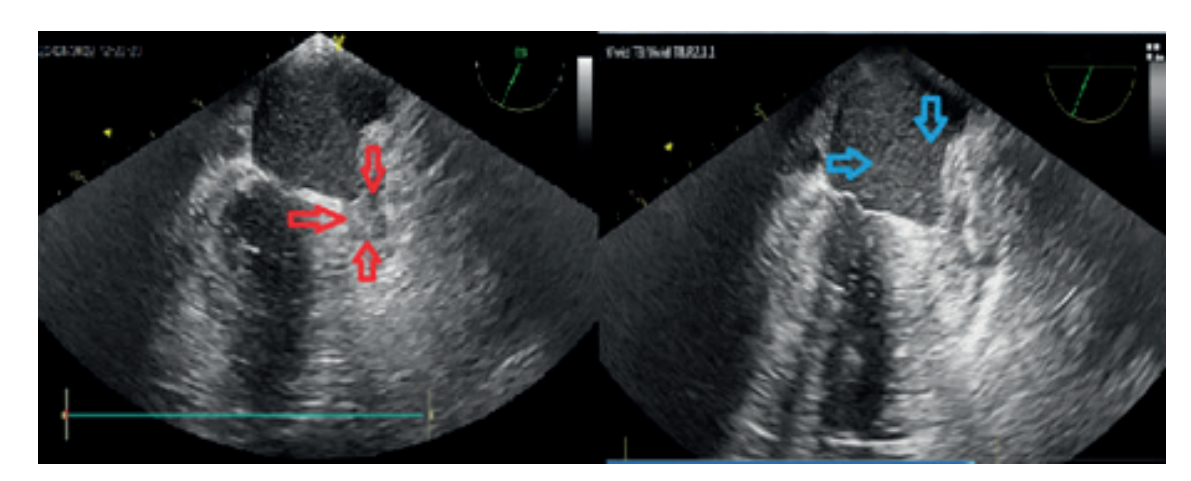
Figure 4. TEE image of left atrial appendix thrombus (red arrows) and left atrium SEC (blue arrows)