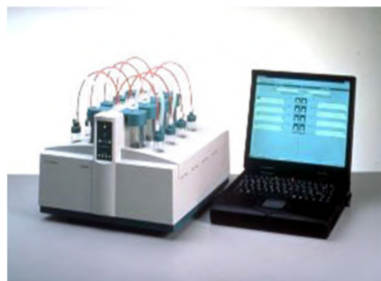
Fig. 2: Oxidation stability tester Rancimat