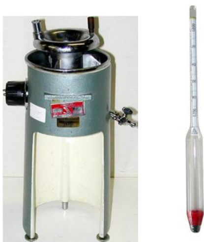
Fig. 1: Redwood viscometer and a hydrometer

The figures of materials are used in experiments.