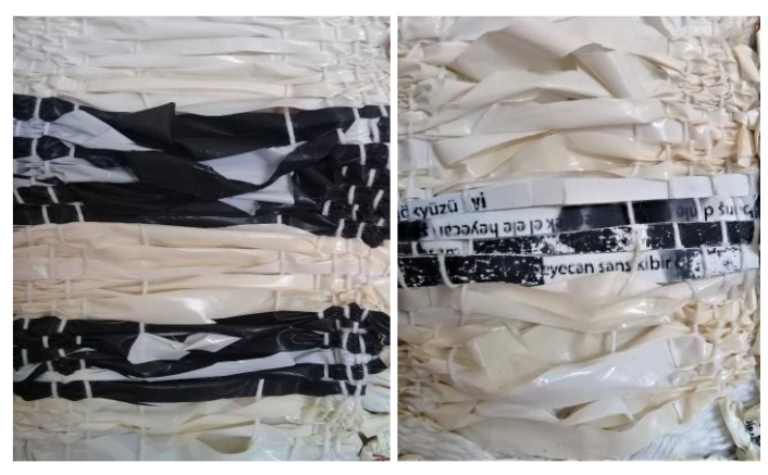
Figure 12. Experiment 6

In Experiment 6, and 7 the cotton warp yarn was drawn with a wide space in the middle. Seven rows of beige and seven rows of black plastic bags were woven alternatively. In Experiment 7, ten rows of flat plastic bags and four rows paper strips were woven one after the other. By combining two materials with different properties, a semi-matt semi-gloss surface was obtained.