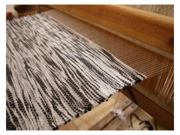
Figure 5. Plastex fabric woven by Reform Studio (woven from plastic bags [20]

Ed Rossbach designed a unique form with plastic bags and newspaper in Figure 4. The glossy effects caused by the plastic material and the matte appearance of the newspaper created a contrast on the surface. The work is woven with the original weaving technique in 75x100 dimensions.