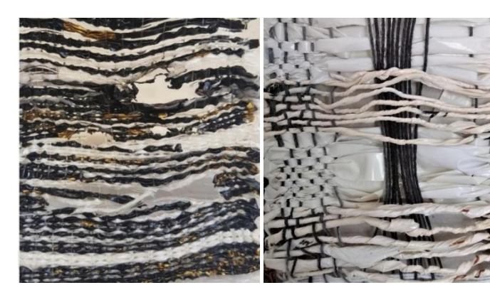
Figure 8. Experiment 2

Experiment 1 was woven with turkish knot and waste plastic market bags of different characteristics in various colors were used. By using thick, thin, soft and rough bags together, a dimensional surface texture was obtained with a stiff and a soft feeling. While the front of the work is dashing (Figure 7a), the back has a sober surface (Figure 7b).