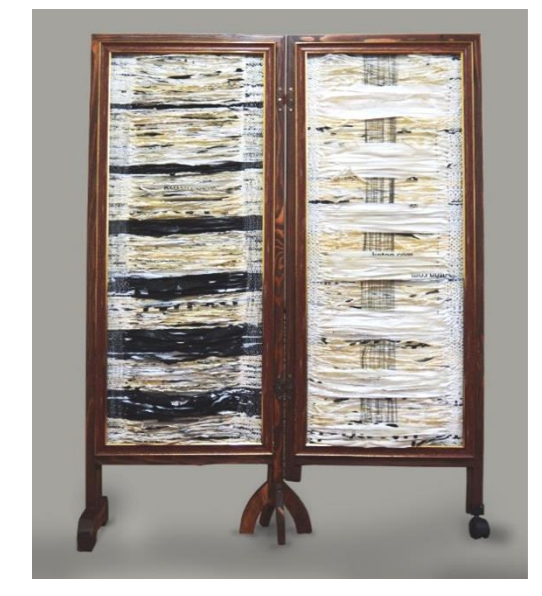
Figure 19. Design 3 and 4, Lale Şanlı, 2017, separator, Lale Şanlı, 2017

copper wire, enriched the surface texture and added dimension. Despite the softness of the plastic bag, a rough texture is obtained with the hard and malleable feature of the copper wire.