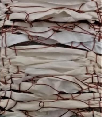
Figure 11. Experiment 5

In Experiment 4, the copper wire used as warp. Seven rows of white plastic bag strips and four rows of copper wire wrapped by plastic bag strips were woven in units. Copper wire wrapped by plastic bag strips were pulled out through the warps. In Experiment 5, copper wire wrapped by plastic bag strips and woven flat-cut plastic bags were picked partially.