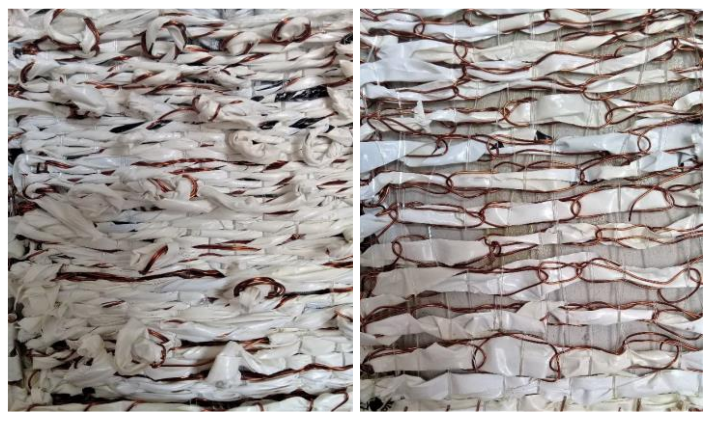
Figure 14. Experiment 8