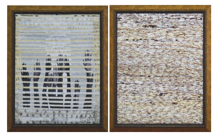
Figure 17. Design 1, Lale Şanlı 2017 Figure 18. Design 2, Lale Şanlı, 2017

The results of 10 texture experiment were observed and evaluated. Among the samples, which were evaluated in terms of functional properties such as suitability for intended use, as well as aesthetic properties such as size, balance, empahsis, composition and texture, 6 trials were designated that were suitable for final designs. Based on the selected samples, 4 designs were woven and these woven surfaces were transformed into interior decoration products such as wall hanging and seperation panel. Approximately 50 Koton plastic store bags were used in the designs. Two of the designs were woven to be panels, and the other two to be used as a separator.