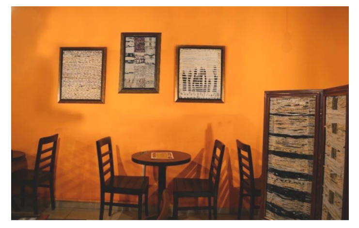
Figure 20. Designs 2, 1, 3 and 4 were placed in the Cogito Café in Mersin.

Figure 20 shows the layout of the panel and the seperator in the space.