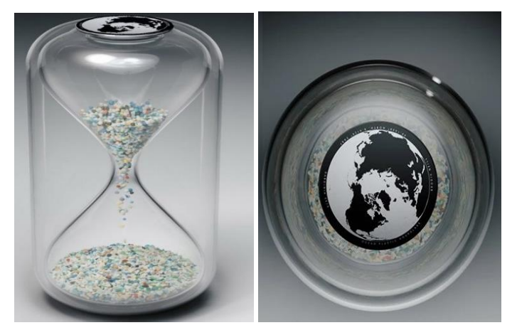
Figure 2. Sandglass design "The Capsule" by Brodie Neill, 2019 [18]

The New York artist Hugo McCloud chose an effective way of recycling by using the plastic bag almost like a paint. The artist created a series called "Burdened" by collaging plastic bags with the technique he developed [19].