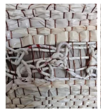
Figure 10. Experiment 4

In Experiment 2, black and transparent market bags were cut into strips and woven in the plain weave. After weaving, it was burned partly. In Experiment 3, beige plastic store bags wrapped with copper wire and flat-cut beige bag strips were woven in units creating horizontal lines.