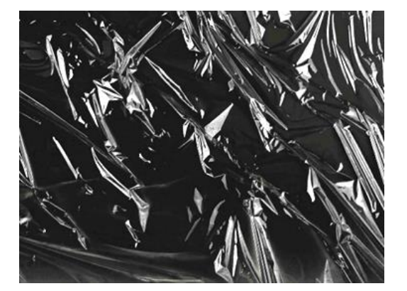
Figure 1. Light refractions on the plastic bag surface [10]

iridescent surface with the effect of light. It has a soft and translucent effect when touched.