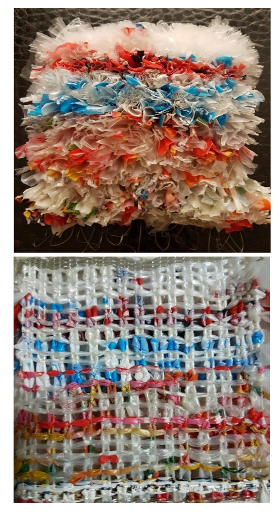
Figure 7. (a, b). Experiment 1, the surface woven by knotting (carpet weaving) technique using grocery bags has a shaggy appearance.

Plastic bags with different properties were used in 10 experimental texture studies with waste plastic market bags ande store bags. The technical difficulties and textural effects of these bags during weaving have been observed by experimental method. In this regard, in four design studies, recycled plastic bags of the Koton Store were preferred, as their softness and flexibility properties would facilitate the weaving process. On the other hand, the light color of these bags also emphasised the textural properties. In order to keep the texture in the foreground, complex weaves and colors were avoided, and a simple plain weave was used throughout the work with a sober approach. The beige color, which is neutral, is used extensively, and sometimes black and white colors are also included. Fine raw cotton yarn is used in some of the designs as warp yarn and flexible fishing line is used in some of the designs. The transparency of fishing line has made the weft threads stand out. Raw cotton yarn, on the other hand, was preferred because of its low cost, and dyeability as well as preventing the plastic bag strips from slippage in the weaving structure.