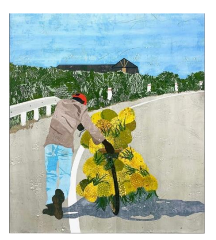
Figure 3. Hugo McCloud, 2020, "Pineapple Express" 2019 [19]