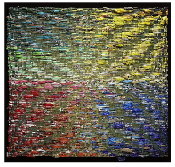
Figure 6. Julie Kornblum, 2008, wall rug named "Plastic in the Trees", [21]

Reform Studio is a design studio founded by designer Hend Riad in Cairo, Egypt. Fabrics, which can also be called plastic fabrics, are woven by a group of women on traditional hand looms in Egypt. These fabrics are used as upholstery fabric in garden and balcony chairs with their durable, washable, dirt-repellent properties, as shown in Figure 5 [20].