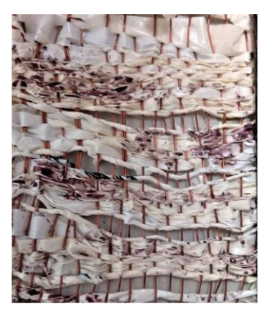
Figure 16. Experiment 10

In Experiment 8, the copper wire was picked simultaneously with several strips of plastic bags. In the weft, the copper wire was coiled up by pulling it in partially. In Experiment 9, plastic bag strips, which were attached to the previously prepared copper loops were woven in plain weave. Then the surface is compressed.