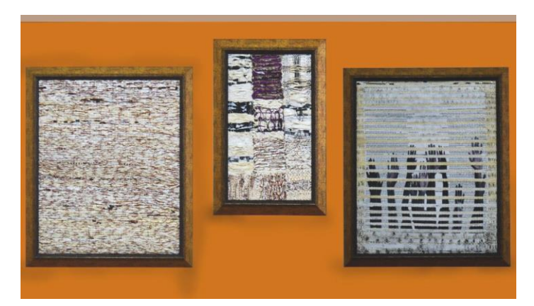
Figure 21. Exhibiting textile surfaces on the Wall