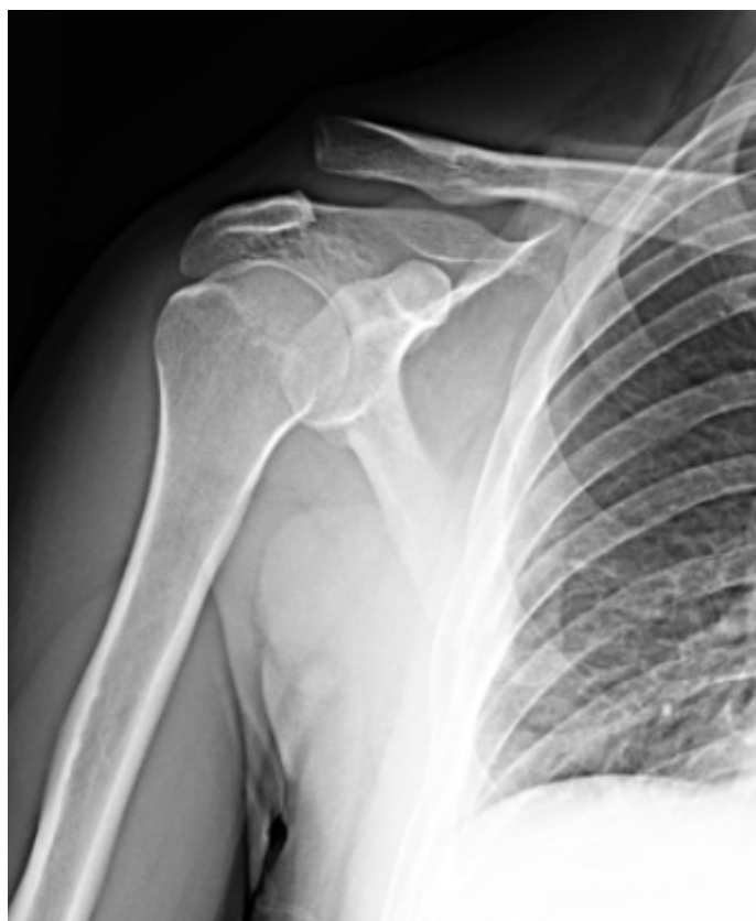
Fig. 1. X-ray image of acromioclavicular joint dislocation.

In our study, we examined 21 patients who applied to our clinic with the complaint of post-traumatic shoulder pain between November 2016 and February 2022 and treated with hook plate after AC joint dislocation was detected. Diagnosis made by direct radiography and MRI was used for Rockwood classification (Fig. 1). The patients included in this study were acute injuries of type 3-5 according to the Rockwood classification, older than 18 years of age, had no history of shoulder trauma or surgery to the shoulder region, and were not accompanied by a clavicle fracture.