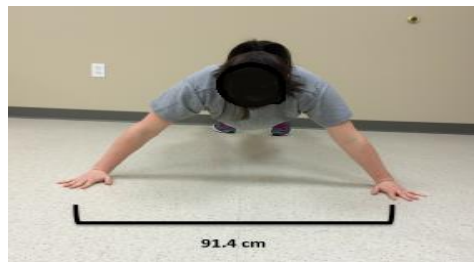
Figure 1. CKCUEST (Silfies., et al. 2015).

3- Strength Score : It is calculated by multiplying the participant's contact score by 68% of the body weight (the percentage corresponding to the weight of the arms, head, and trunk) and dividing by 15 (test time in seconds) (Tucci et al., 2014).