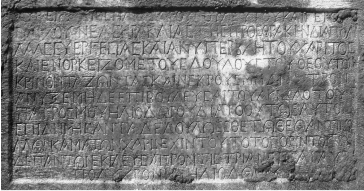
Fig. 1) The Inscription