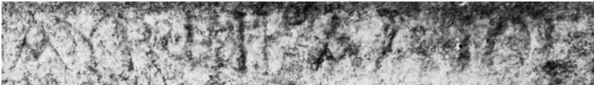
Fig. 2) The first two words of line 1.