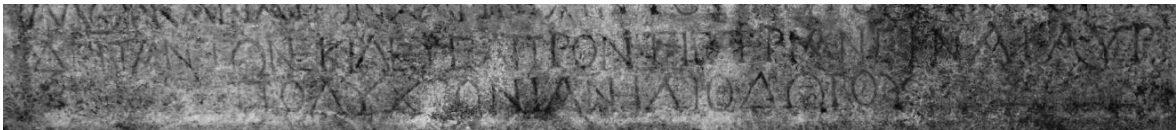
Fig. 3) The last two lines of the inscription.

This inscription belongs to the relatively small number of tomb inscriptions which are not formulated with standardised phrases. It is therefore no surprise that it contains more than only trivial information; the message of this inscription is unusual and expressed in an unusual manner. First of all, the person who has composed this inscription, made many orthographical 10 and grammatical 11 mistakes. It is pretty astounding to see that a member of the leading class had such a bad command of Greek language. In addition, the stonecutter, who engraved the text in the tabula ansata, made at