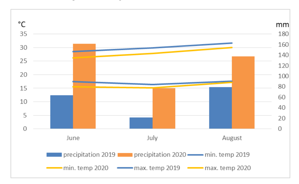
Figure 1- Meteorological data for the vegetation season (june-august) 2019 and 2020 in Novi Sad, Serbia Min t - minimal temperature, Max t - maximal temperature

The experiments were conducted at the Sunflower Department's disease testing nursery of the Institute of Field and Vegetable Crops in Rimski Šančevi, Novi Sad, in 2019 and 2020. On April 18<sup>th</sup>, 2019, the 80 selected inbred lines from the sunflower gene pool at the IFVC Novi Sad, Serbia were planted. However, inbred line PR-ST-28 was eliminated due to its low emergence, leaving 79 inbred lines for M. phaseolina resistance screening at the end of the growing season. Based on their resistance levels, 15 inbred lines were chosen for the following year's trial, which were planted on May 5<sup>th</sup>, 2020. The meteorological data analysis for the two-year weather conditions is presented in Figure 1 (RSRHZ 2023).