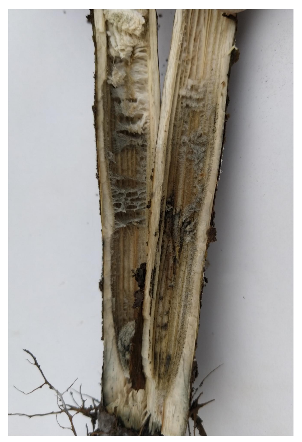
Photo 1: Longitudinally cut of sunflower stem with visible multiple microsclerotia and damages of infection with Macrophomina phaseolina

At the maturity stage (R8) of sunflower, symptoms of M. phaseolina infection were evaluated (Schneiter & Miller 1981). Each plant stem was longitudinally cut (photo 1)., and the length of the tissue with visible microsclerotia was measured and evaluated with grades from 0 to 8: (0-(0-5 cm); 1-(5-10 cm), 2-(10-20 cm); 3-(20-30 cm); 4-(30-40 cm), 5-(40-50 cm); 6-(50-60 cm); 7-(60-70 cm): 8-(more than 70 cm). Any plants displaying symptoms of other diseases were removed before the end of the growing season.