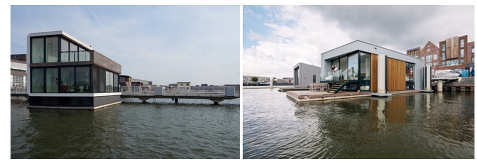
Figure 2. Floating Villas Designed by Waterstudio.NL (2015).

Within the scope of the study, Oceanix City, Maldives Floating City, and Aequorea projects, which are proposed as a solution to climate change, were examined. The projects were analyzed in the context of planning, inspiration, accessibility, power supply,