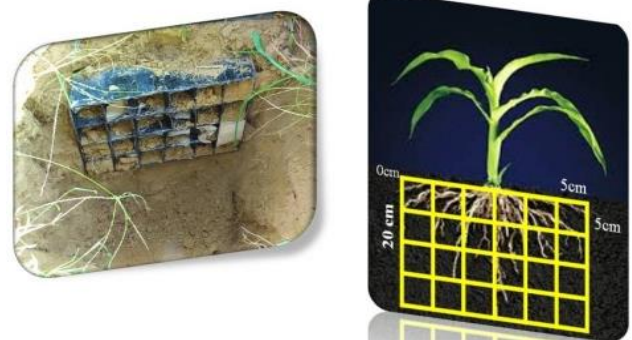
Figure 2. The iron box which has a sharp edge is pressed horizontally in the soil profile

Some parameters of root distribution were calculated such as root length was measured by the formula that was simplified and adjusted by Tennant (1976) as following: