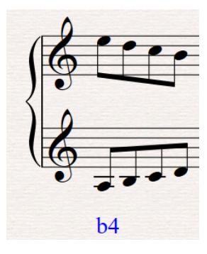
Figure 2: The 'cells' from the first motive of Music in Contrary Motion, transcribed and grouped by Torun for this essay

Figure 2 shows the four cells which the first of twenty-three motives consists of. The cell 'b4' is derived from 'a4'. Likewise, 'y5' is derived from 'z5' hence the same colours. The numbers are to indicate the number of tones each cell contains. According to this system, the first motive is 'a4 z5 y5 b4 y5 z5'. Thus, the second half of the motive, 'b4 y5 z5', is derived from the first half. Furthermore, as illustrated below in figure three, each part is the inversion of the other.