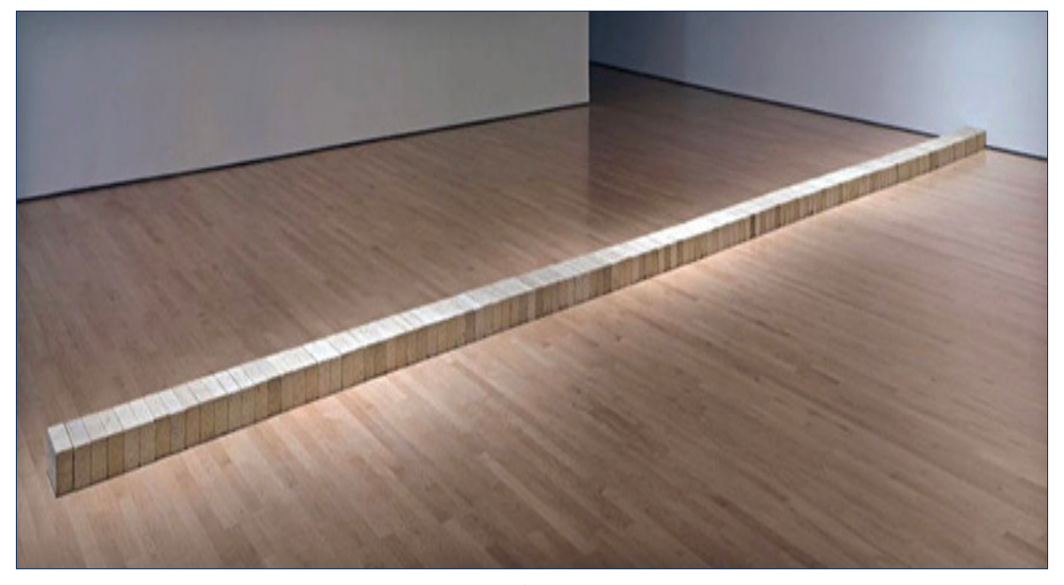
Figure 1: Andre, Lever, 1969