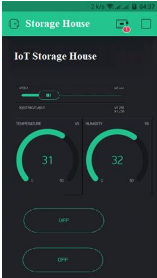
Figure 3. System dashboard design.

temperature sensors are sensitive devices, which were incorporated into smart system to monitor the temperature and humidity level inside the storage system. The graphical user interface (GUI) used in selecting commands in this system is presented in Figure 3. On the System dashboard is the Switch “ON” and “OFF” buttons, which allows the user to switch on the heater and fan from anywhere, provided there is internet network.