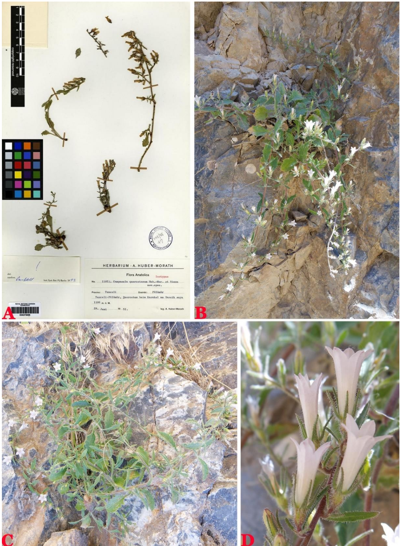
Figure 4. Campanula quercetorum subsp. quercetorum . A: Isotype (E!), B-C: Habitus, D: Flowers.