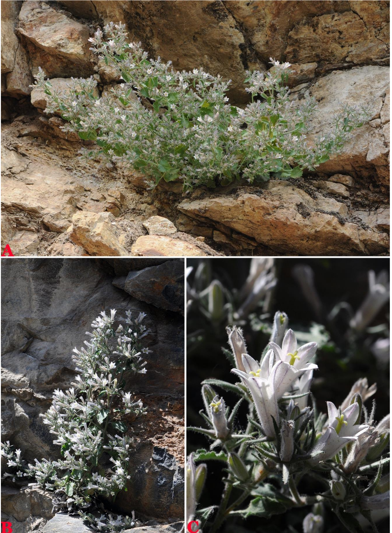
Figure 3. Campanula quercetorum subsp. densiflora . A-B: Habitus, C: Flowers.