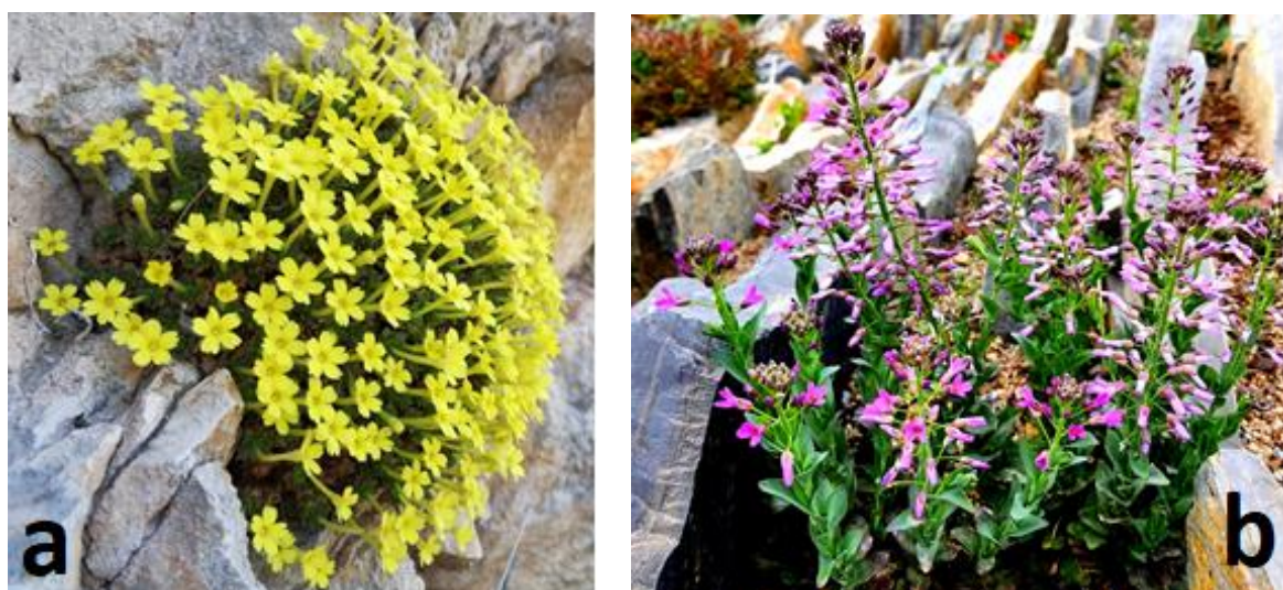
Figure 3. a. Dionysia zeynepiae , which was discovered last year in Hatay by the second author (Yelda Güzel), is a showy species that is an ideal ornamental for rock gardens. Cultivation studies on it are continuing. b. Noccaea ali-atahanii , discovered by the authors in Hatay in 2018, is in bloom at Nezahat Gokyigit Botanic Garden in İstanbul in March 2022.