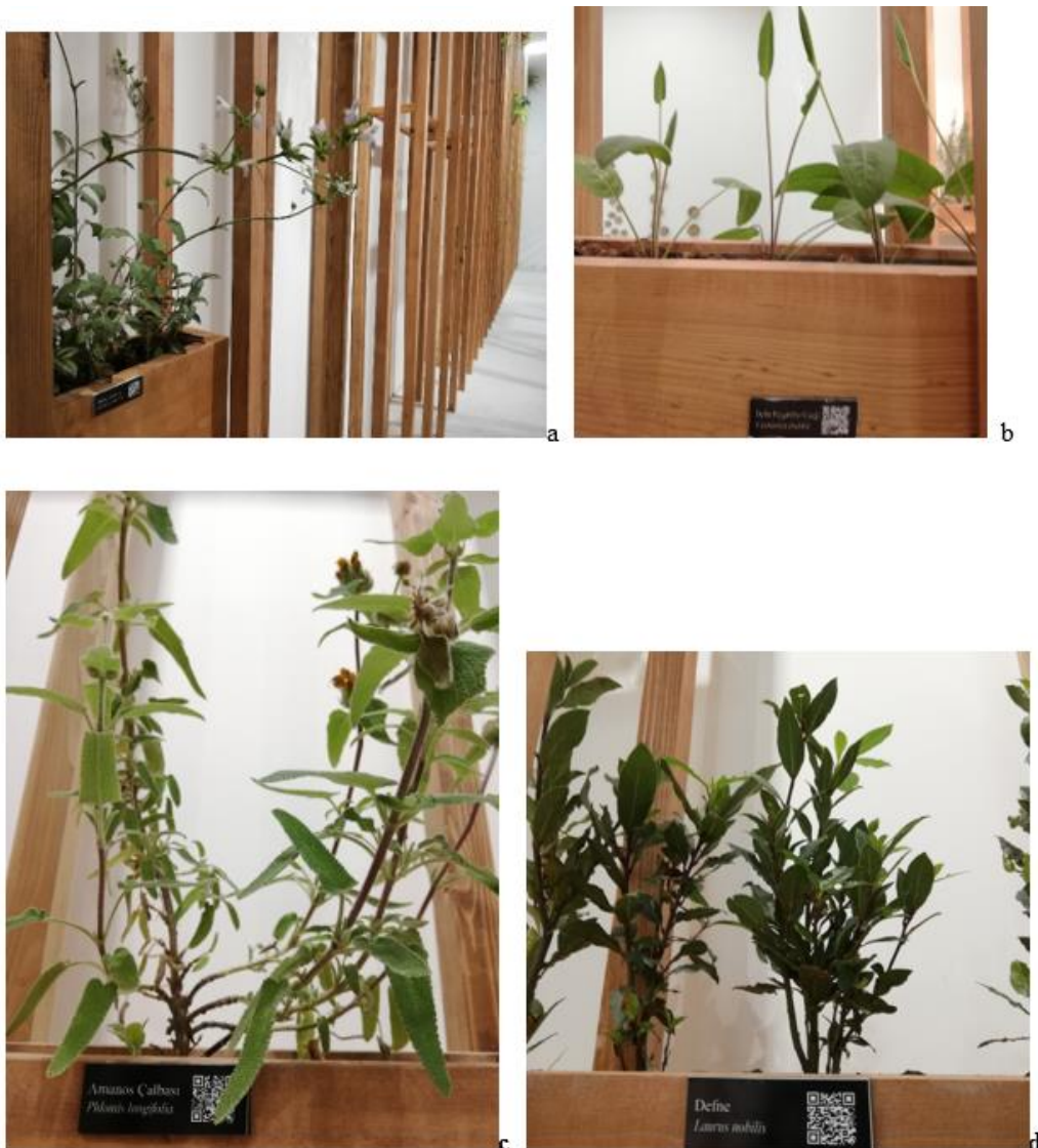
Figure 5. Examples of some wild native plants grown as ornamental plants in EXPO-2021 in interior designs. a. Salvia aramiensis b. Centaurea doddsii c. Phlomis longifolia d. Laurus nobilis .