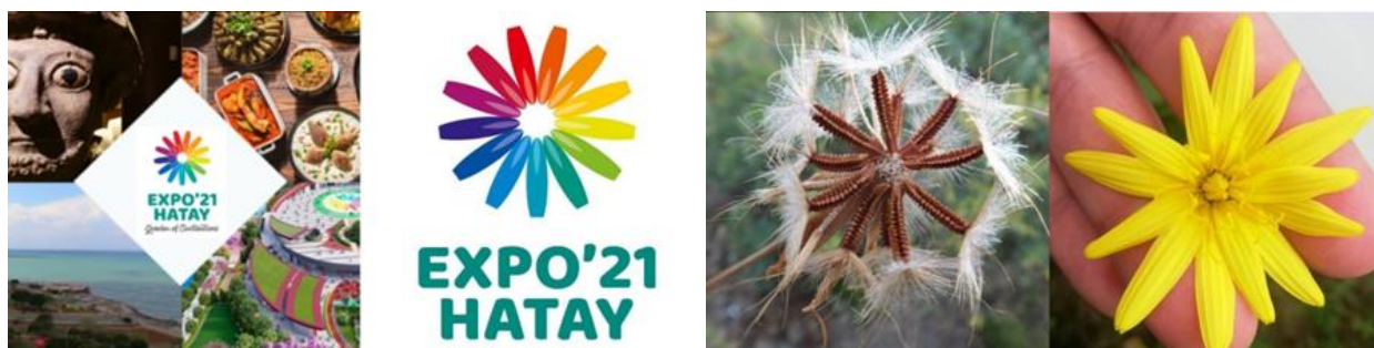
Figure 2. Discovered by the authors in 2013 and named "paci=peace" after the atmosphere of peace and tolerance in the multicultural city Hatay, Scorzonera pacis was grown in the gardens of EXPO-2021 and became the emblem of the event. Some examples of promotional posters for the event; the achenes of the plant, which are unique to the genus; on the right, the capitulum embroidered in the emblem.

Notably, Scorzonera pacis was chosen as the emblem of EXPO-2021 Hatay (Figure 2), N. ali-atahanii has also been successfully cultivated in the Nezahat Gokyigit Botanic Garden in İstanbul (Figure 3b). Cultivation studies on the remaining plants continue. The main difficulty we encountered in cultivation involved germinating seeds. All plants that were able to overcome the germination difficulty and become seedlings, as we expected, easily grew and were transferred from the nursery to the garden (Figure 4). They could even be used in interior arrangements (Figure 5).