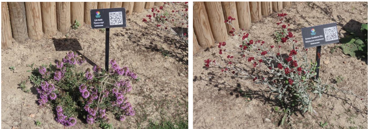
Figure 4. Examples of some wild native plants grown as ornamental plants in EXPO-2021 gardens. A. Thymus eigi B. Helichrysum sanguineum .