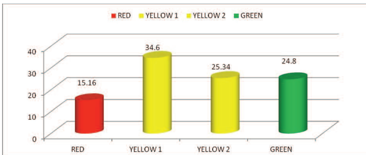
Figure 1. Triage distribution percentage of the patients brought by 112 Emergency Health System