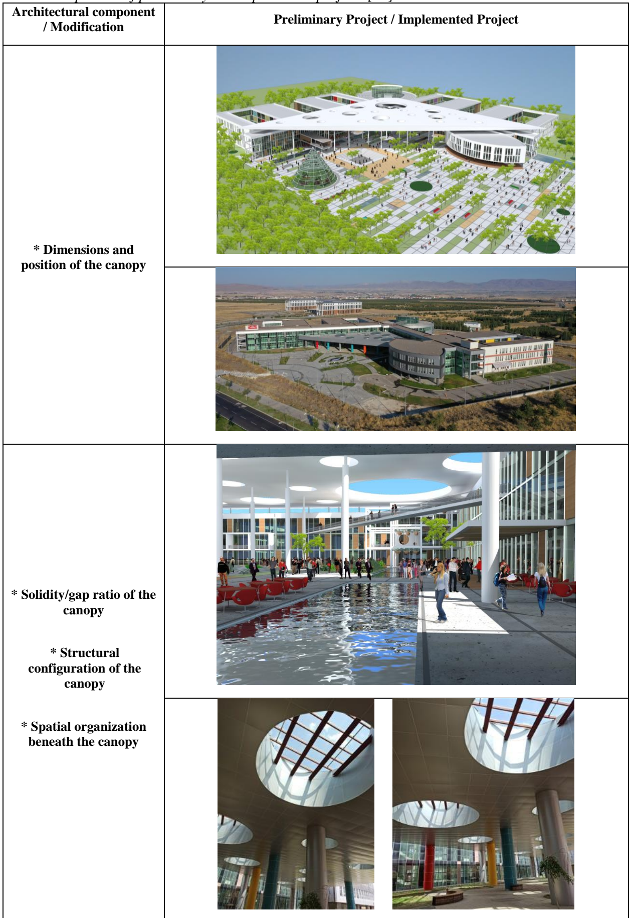
Table 1. Comparison of preliminary and implemented projects [16]