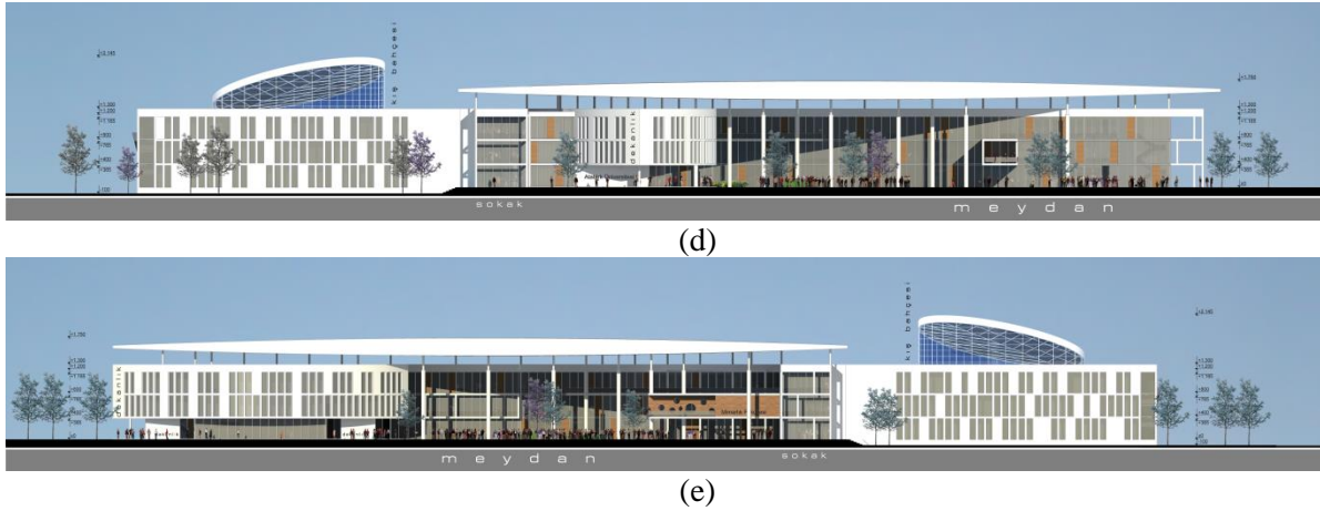
Figure 4. Preliminary architectural design of the Faculty of Architecture and Design: (a) perspective view of student and dean's entrance, (b) section, (c-d-e) elevations [16]

In the implementation project, some changes can be observed compared to the preliminary architectural design. The number of educational blocks, which was initially planned as 4, has been reduced to 3 in the implementation project. The overall interior space planning has been preserved from the preliminary design to the implementation project. However, the wings containing academic staff rooms in the blocks have been extended by 1 module. In the preliminary design, there was no elevator in the dean's office block but in the implementation project, a panoramic elevator has been added next to the staircase to provide vertical circulation. The dimensions of the upper canopy located at the square have been reduced. The arrangement of the structural elements supporting this canopy has also been modified. Changes in proportions and gap ratios have occurred due to the reduction in dimensions. Transformations have also been made in the spaces under the canopy. The bridge and cantilever mass connecting the two facades have been removed in the implementation project. The green areas in the campus have been extensively revised. Water elements, the amphitheater and the greenhouse have been completely eliminated.