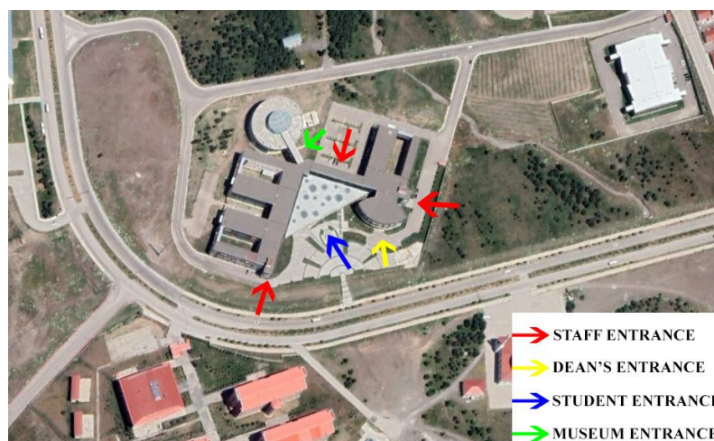
Figure 3. The location of Faculty of Architecture and Design at Atatürk University

Since October 2017, the educational activities of these mentioned departments have been carried out in the newly constructed western campus [15]. The faculty building where these departments are located currently has separate entrances for students, staff, the dean's office, and the Biodiversity Science Museum (Figure 3).