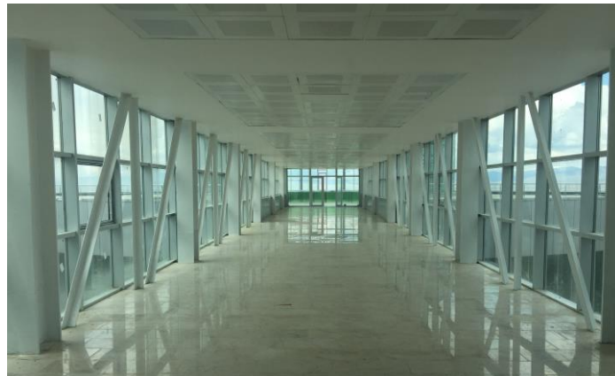
Figure 5. The bridge between the faculty and conference hall block

When the usage process is studied, the main revision should be defined as the transformation of the block originally implemented as the conference hall into the Biodiversity Science Museum. Accordingly, a new entrance point has been defined for this mass, and the function of the bridge that connects it to the faculty building has been terminated (Figure 5). The gap created as a result of reducing the 4 educational blocks in the preliminary design to 3 in the implementation project has been transformed into a parking area during the usage process. The water elements, amphitheater, greenhouse, etc., within the campus have been replaced with predominantly paved surfaces, converting them into vehicular roads. In terms of environmental landscaping, paved surfaces have been applied instead of the amphitheater and greenhouse. A water element that enhances the visual aesthetics has been constructed in the area where the amphitheater was located. The gaps in the upper canopy (entrance canopy) have been enclosed with glass and steel structural elements due to adverse effects of inclement weather conditions (Table 1).