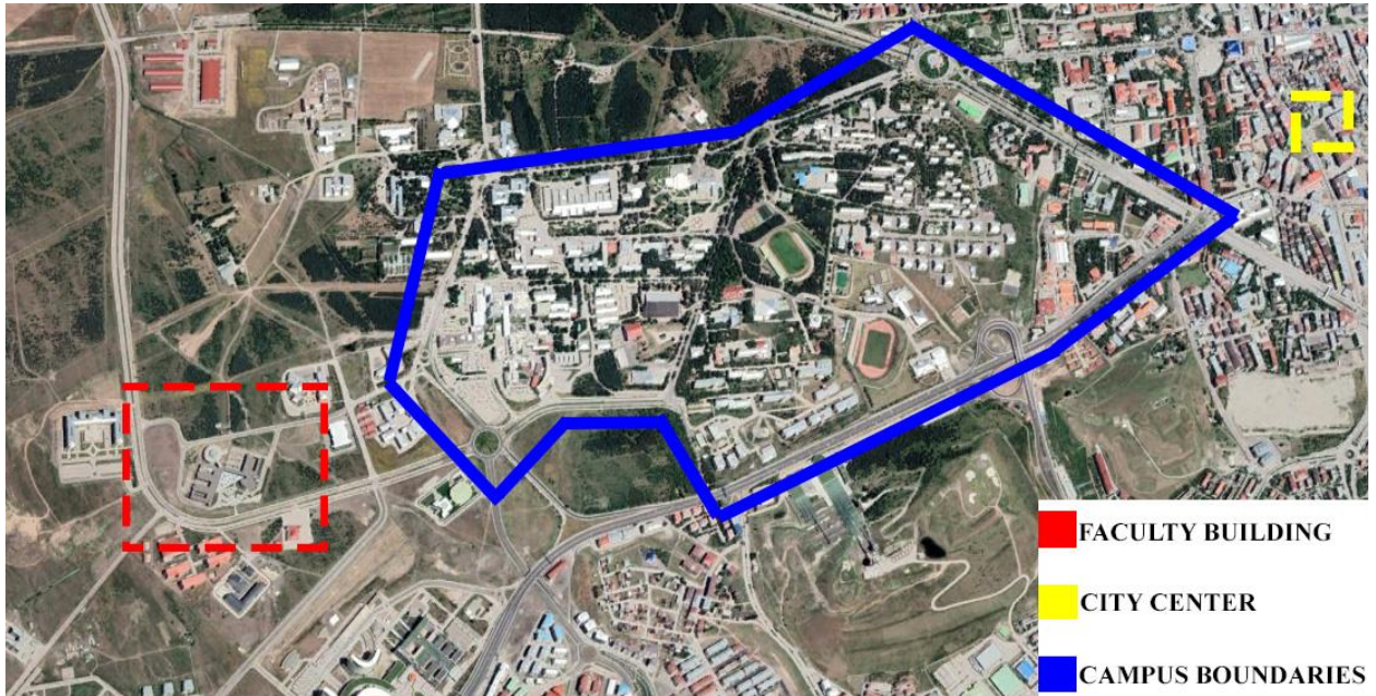
Figure 2. Aerial photograph of Faculty of Architecture and Design, city center and campus boundaries

vehicular and pedestrian circulation. When viewed from a larger scale, the campus is located in the central area defined by the eastern edge of the city. The Faculty of Architecture and Design is constructed west of the initial boundaries of the campus (Figure 2).