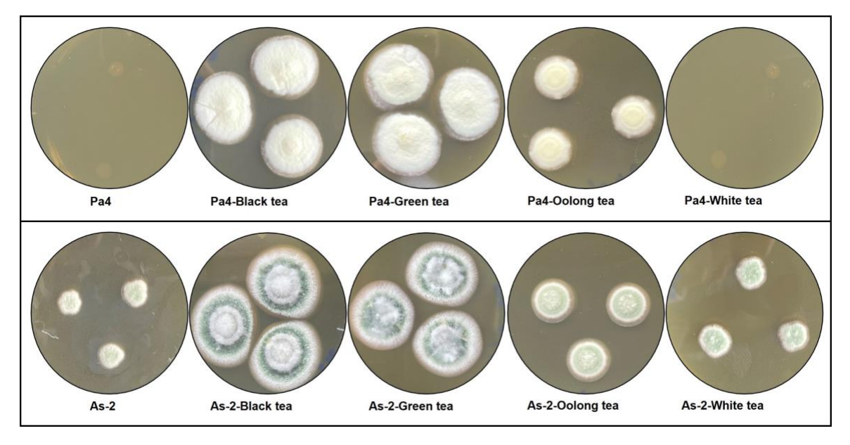
Figure 1. Radial growth of Beauveria bassiana Pa4 and Metharizium flavoviride As-2 isolates at 120 min UV-B exposure.