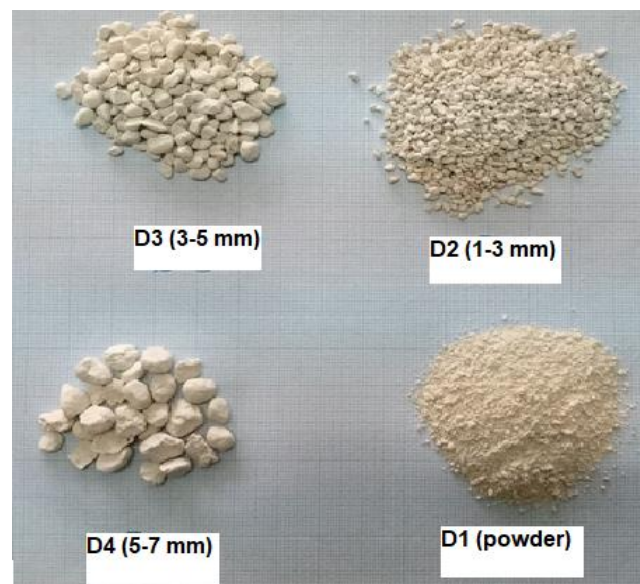
Figure 1. Diatomites used in the experiment

control group). The 1 st group (D1) received powder diatomite, 2 nd group (D2) received 1-3 mm diatomite, 3 rd group (D3) received 3-5 mm diatomite, 4 th group (D4) received 5-7 mm diatomite, whereas diatomite was not used in the control group (C) (Figure 1). The feed used in the study was included as the waste material source in the environment (Kbria et al., 1997).