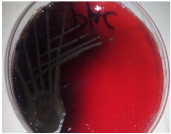
Figure 1. Colony morphology of Listeria in PALCAM agar

Figure 1 shows the black sunken centre and a black halo on a cherry-red background, following aesculin hydrolysis and mannitol fermentation of a typical listeria characteristics. Table 1 shows the result of the fried fish, working slab and tools samples examined for L. monocytogenes . Out of 2400 fried fish, 800 working slab and 800 tools examined, 528 (22%), 313 (39.13%) and 195 (24.38%) were positive for L. monocytogenes respectively. About 25.90% of the total samples examined were infected with L. monocytogenes .