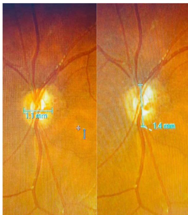
Figure 1: Severe hypoplasia of the optic nerve in the left eye. The left optic disc appeared quite small. The left optic disc was slightly pale and surrounded by a double ring.

The ultrasound B-scan showed no shadowing of the optic nerve in the left globe. The intraorbital course of the left optic nerve was absent in the retinal segment. A thin cord was visible in the posterior segment. There were no significant abnormalities of the brain (Fig. 4).