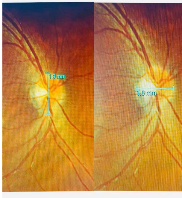
Figure 2: Right eye is normal