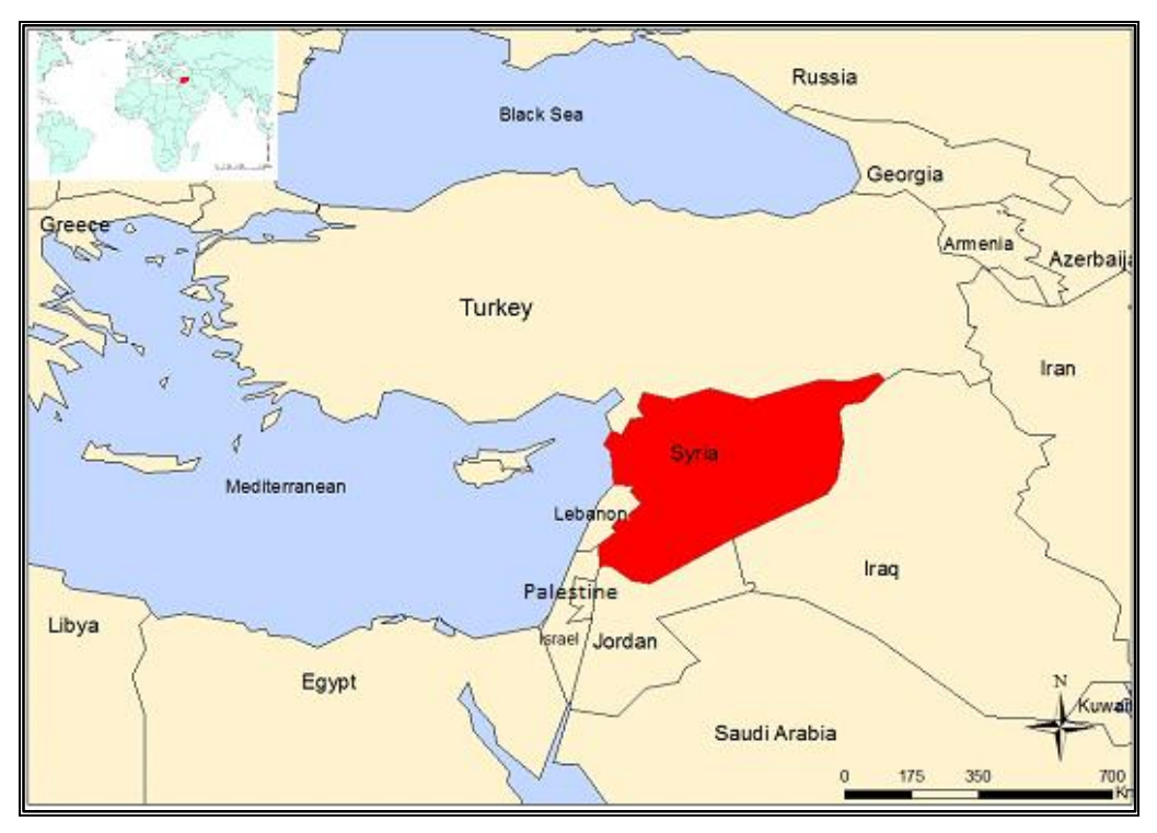
Figure 1: Syria's geographical location