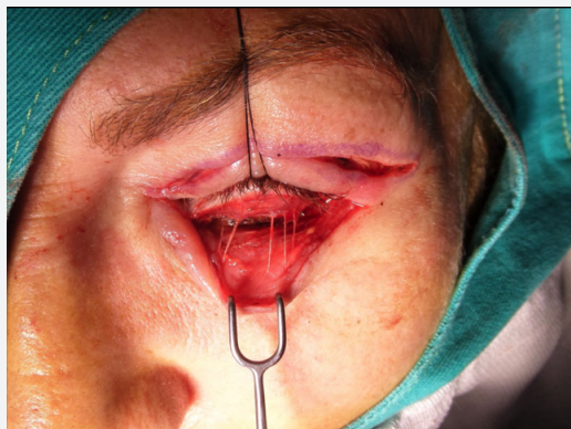
Fig. 2. Preserved motor branches of pretarsal orbicularis oculi muscle

We had only 8 complications, 3 limited hematoma which did not need to reoperation, 3 corneal edema and