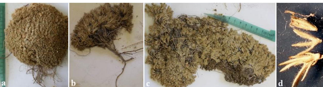
Figure 1. Holotype (a), isotype (b,c) specimens, and leaves, bracts, calyx and stamens of Bolanthus sertavulus Özçelik (in Hb. GUL)

Description: Glandular perennial herbs. Roots soft, thin, long; young (thin) roots pilose hairy, bright colored. Above-ground parts (3-) 5-10 (-15) cm in diameter, cushion forming, middle of which is like a dome, forming a pillow. Stems short, up to 1 cm tall, clearly shorter than leaves, very branched at base, covered with old and/or dead stem remnants and clumps at base. Internodes very short, slightly visible; stem, leaf, bract and calyx covered with dense long glandular hairs. Leaves in bunches, cylindrical, pointed at ends, 1-veined, up to 4 x 1 mm, often glandular hairy, gradually enlarging with a membranous structure towards base. First leaves oblong-linear, shorter and less hairy than the later leaves. Flowers sessile, usually 1 per fascicle.