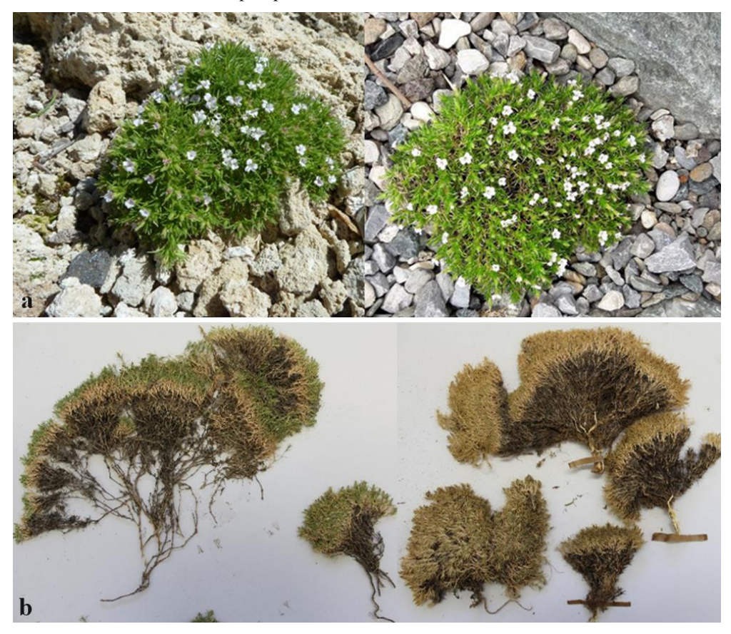
Fig. 2. Samples of Bolanthus cherlerioides in natural habitat (a), and from GUL Hb.(b), Isparta: Özçelik 9708.

Investigated herbaria specimens for B. cherlerioides : Isparta-Konya: Özçelik 7957, 7958, 9161, 9231, 9708, 9229, 9230; 9239, 9233; 9223, 9225, 9228, 8863, 8864, 9227, 9228, 9226, 9224, 9232b! in GUL Herbarium. Konya: 9340 (in GAZI!); Özçelik 7264 (GAZI!); H. Ocakverdi 238/804 (KNYA 1213!). Antalya-Adana: 805 (KNYA14502!): Afyonkarahisar: GAZI 35677!.