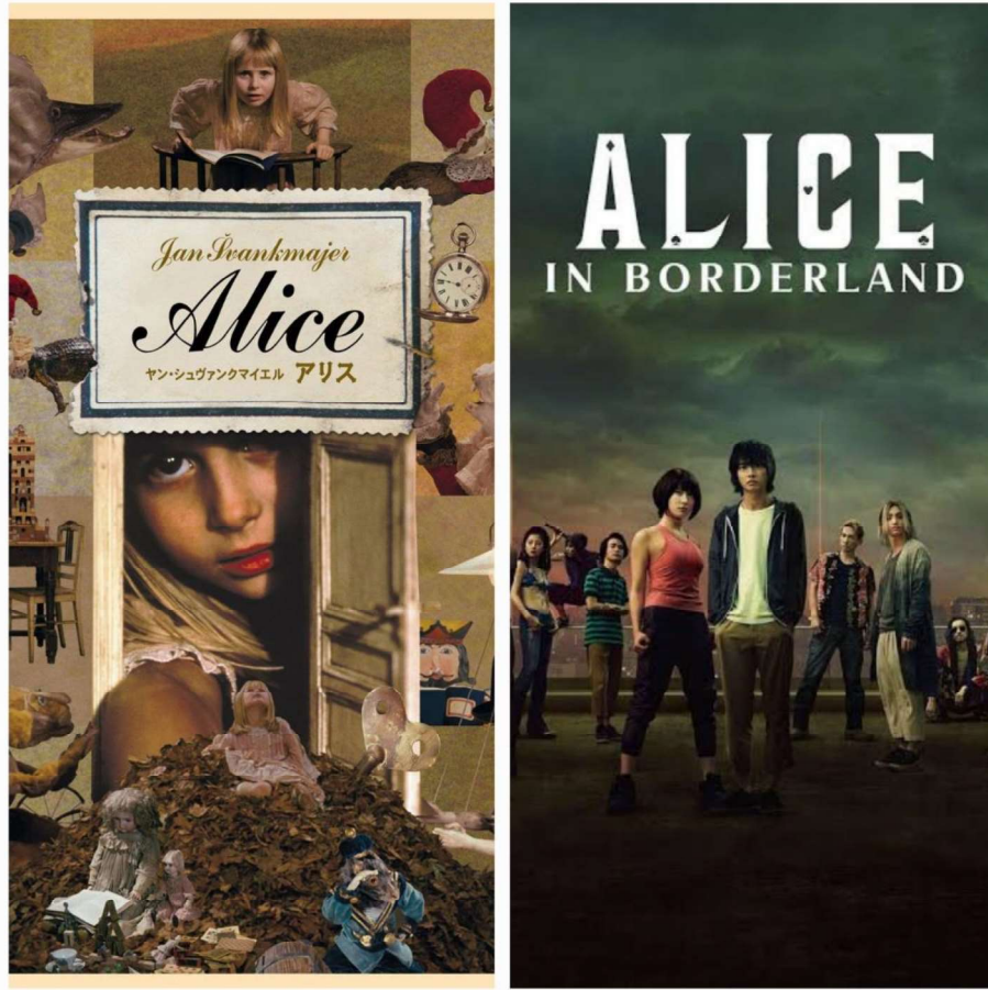
Picture I. The posters of Svankmajer's Alice and Alice in Borderland . The pictures are taken from IMDB and collaged by me.

Additionally, Salvador Dali's illustrations of AAW for each chapter of the work stand out as another representation of artwork. Dali recreates fundamental points of the novel on an intermedial level and demonstrates his own perception; below "Mad Tea Party", "Pool of Tears", "Advice from a Caterpillar", "The Lobster Quadrille", "The Mock Turtle's Story", and "The Queen's Croquet Ground" can respectively be seen: