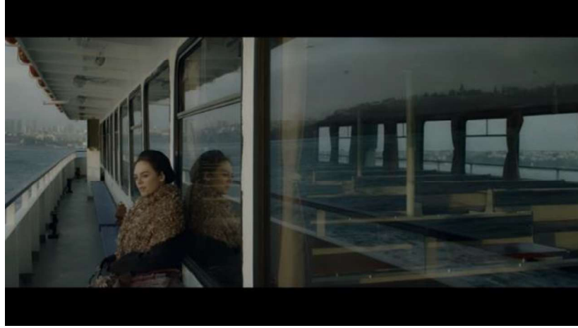
Picture IV. The Last scene of Serial Cook , movie screenshot