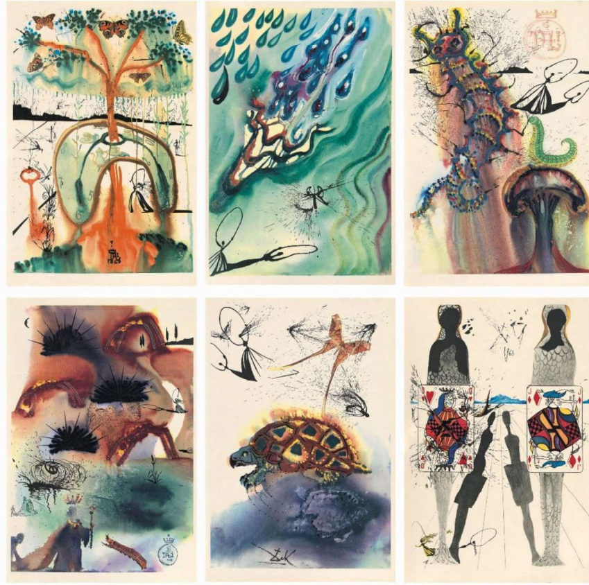
Picture II. Dali illustrations (1969) in the 150 th anniversary edition of AAW (Sierzputowski, 2016)

Without a doubt, there are countless other examples of works, video games, instruments such as theme parks, recalling Alice books. Lewis Carroll's works, being the core of a myriad of transmedial and intermedial texts, is a manifestation of their canonical aspect certainly, that draws a mechanism where these source texts are placed at the centre; however, these amalgamations reinforce the impact of "new" texts, which also forms the main argument of this article.