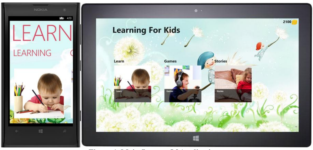
Figure 1. Main Screens Of Applications.

The learning and examining processes are divided into levels in each of concepts. As level goes higher the difficulty of concepts goes higher and upper levels cannot be reached before the lower is complete. In the first version of our M-Learning system, the learning module includes 14 types of basic concepts which are supported by visual and sound effects and animations. Besides interaction with the touch screen is provided.