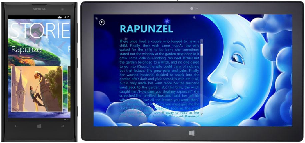
Figure 3. Stories Module Of Application.

Story module includes 3 classic stories. These are Rapunzel, Puss in the Boots and Cinderella. In story module parents can read the stories to their children or children can easily listen the stories themselves.