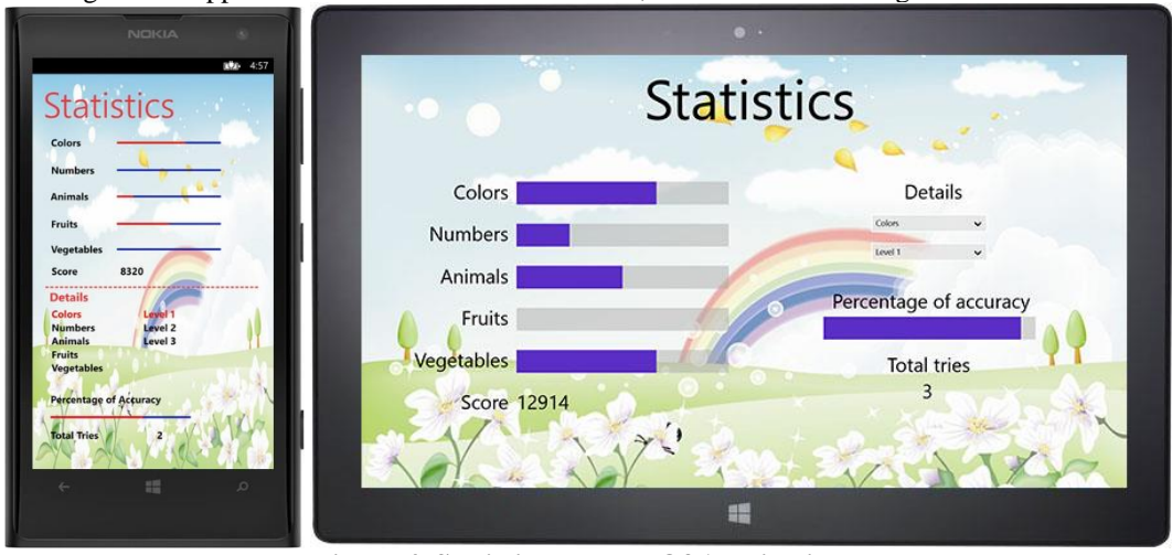
Figure 4. Statistics Module Of Applications.

The statistics module is the most important module for parents to observe the progress of the children. The parent who logs in our application will be able to see success, mistakes and learning abilities of their children.