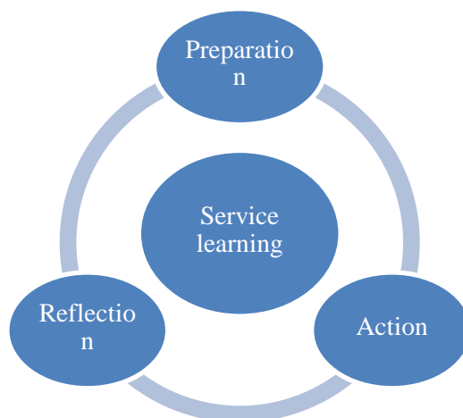
Figure 2. Service Learning Phases

They have a willing to serve community based on deep awareness to social responsibility, discuss of what they have learned from field experiences, and think about group-based learning through reflection (Clayton & Ash, 2005; Deely, 2010). Learning innovation is created as well as they have learned from university and adapted to local practices (Power, 2010). It needs them to have skills helping them to survive, learn, adapt, and contemplative practices. The outcome of service learning enhance characteristic of good citizenship (Scott, 2006; Prasertsang et.al. , 2013). It can be concluded that service learning explain itself in the role of education for holistic view in academic, skills, and attributes that response to social needs in the current situation and future. They have cooperating in participation in community sustainable development because they are outcomes of community to do and response to a partnership in education and development as well as they have a meaningful learning (Butin, 2005; Braskamp & Engberg, 2011). Community care is a best way to let them participate in learning together with community members, happy, love, peace, awareness and social responsibility (Silcox, 1995; Galvan & Parker, 2011).