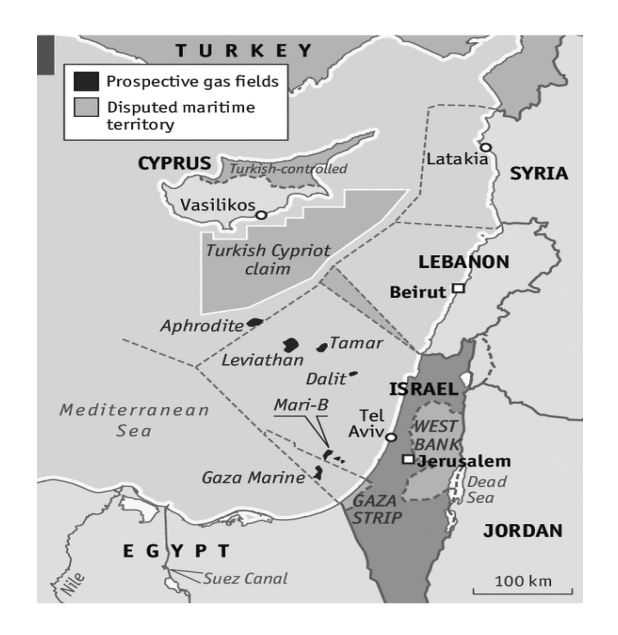
Map 2. Natural Gas fields in the East Mediterranean Sea

resources of Israel have been estimated around 905 bcm as of 2015.<sup>30</sup> In near future Israel will be able to change its current status of energy importer to energy exporter, likely affecting geopolitical situations within the region. While Russia continues to be a supplier of oil to Israel, relations in the energy sphere between the two states will change too.