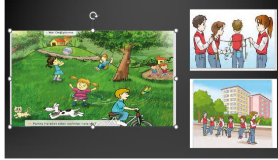
Figure 1. Third grade science textbook MEB Publications

The visuals used in the textbook review report of PT7, respectively, are given below.