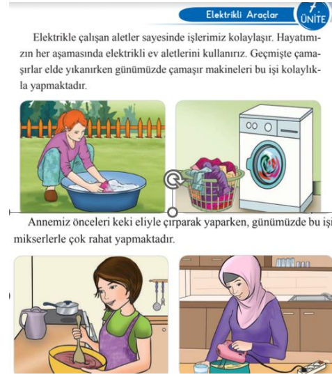
Figure 4. Fourth grade science textbook (ATA Publications) and third grade science textbook (ANKA Publications)

In the theme of teacher roles , the determinations and opinions of pre-service teachers are gathered in two different categories. These are the role of the teacher in ensuring gender equality and the correct use of textbooks in terms of gender equality. In both the reports and the interviews, pre-service teachers stated that the teacher has an important mission in ensuring gender equality. They stated that teachers have an important effect on breaking down the stereotypes identified in textbooks, preventing the formation of false stereotypes, ensuring the representation of girls in all areas of society, and adopting gender equality. In addition, another issue reported by pre-service teachers is that textbooks should be used correctly in terms of gender equality and that the teacher has a significant role in this regard. In the interviews, the effective role of the teacher in terms of using textbooks correctly in the context of gender equality was also expressed. Excerpts from the determinations and opinions of pre-service teachers regarding the theme of teacher roles and subcategories are given below.