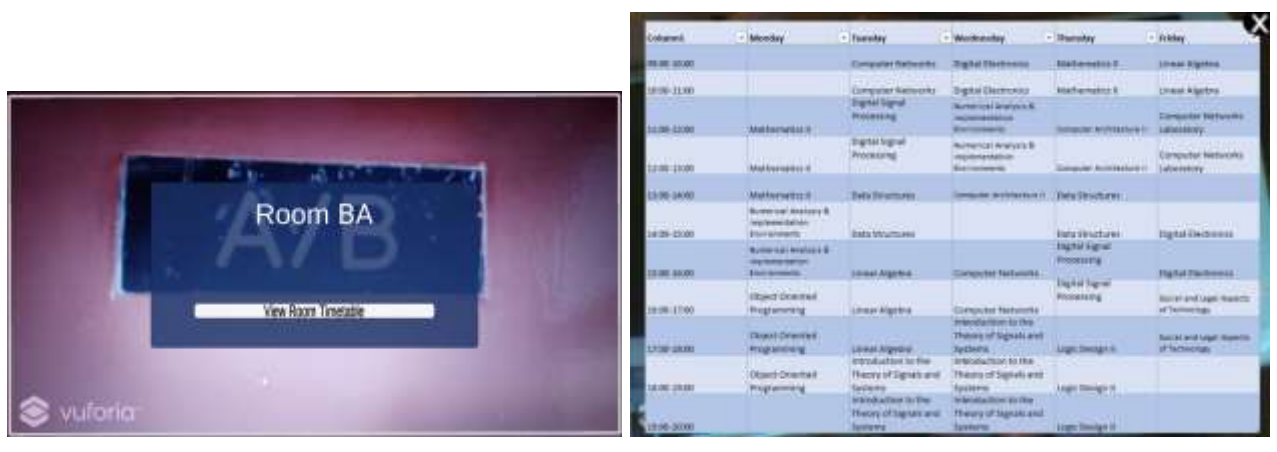
Fig. 3: When a. auditorium is identified, users can view its weekly schedule.