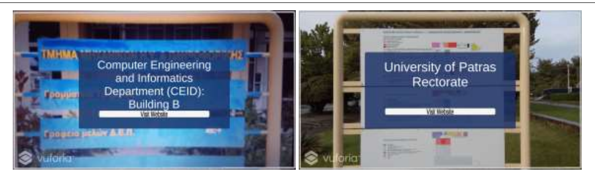
Fig. 1: When a building is recognized, users can visit the official website of the corresponding department.