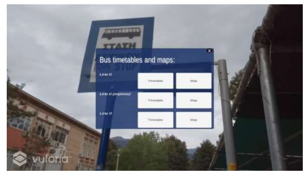
Fig. 6: When a bus stop is identified, users can view available lines, itineraries and timetables.