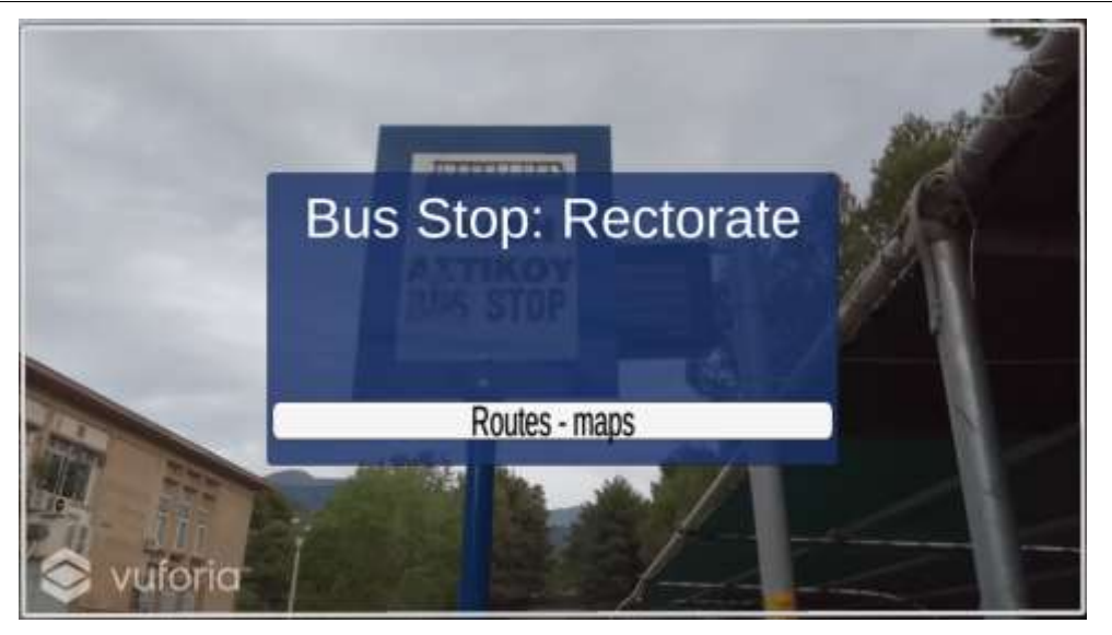
Fig. 5: A bus stop (a type 3 point of interest (POI)) has been identified.