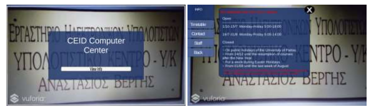
Fig. 4: When facilities are identified, users can view useful information for e.g. timetables and contact.