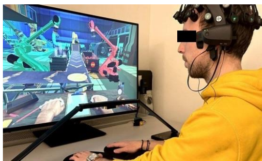
Figure 3. Mind control in a VR game through Brain-Computer Interface

brainwave-controlled computer games, and related fields (Thomas et al. 2013). Real-time monitoring of brain activity presents a range of opportunities, including support for physical health, mental well-being, and methods of interaction controlled by thought. Moreover, these technological tools have the potential to facilitate the exploration of experiences among disabled individuals, particularly those with an interest in esports, ultimately enhancing their overall gaming experiences (Knierim et al. 2021).