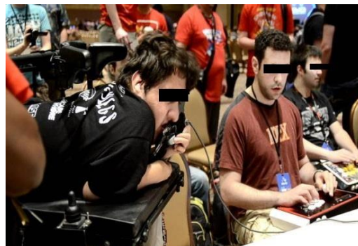
Figure 2. Professional esports player called Brolylegs and an adaptive Xbox controller

nondisabled individuals. Brolylegs is also celebrated as the author of the book titled “ My Life Beyond the Floor ”.