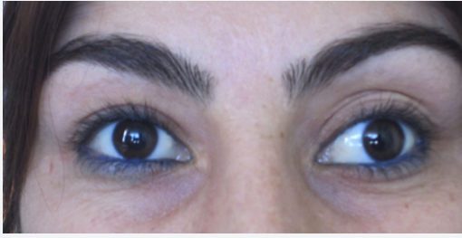
Fig. 1. Monocular sensory exotropia in her left eye

was reported by the patient or her parents. However, the parents described a trauma to her left eye at the age of seven, and in the subsequent years she developed exotropia. Routine blood tests were within normal range. Our diagnosis was cataractous or clear lens absorption secondary to trauma and sensory exotropia.