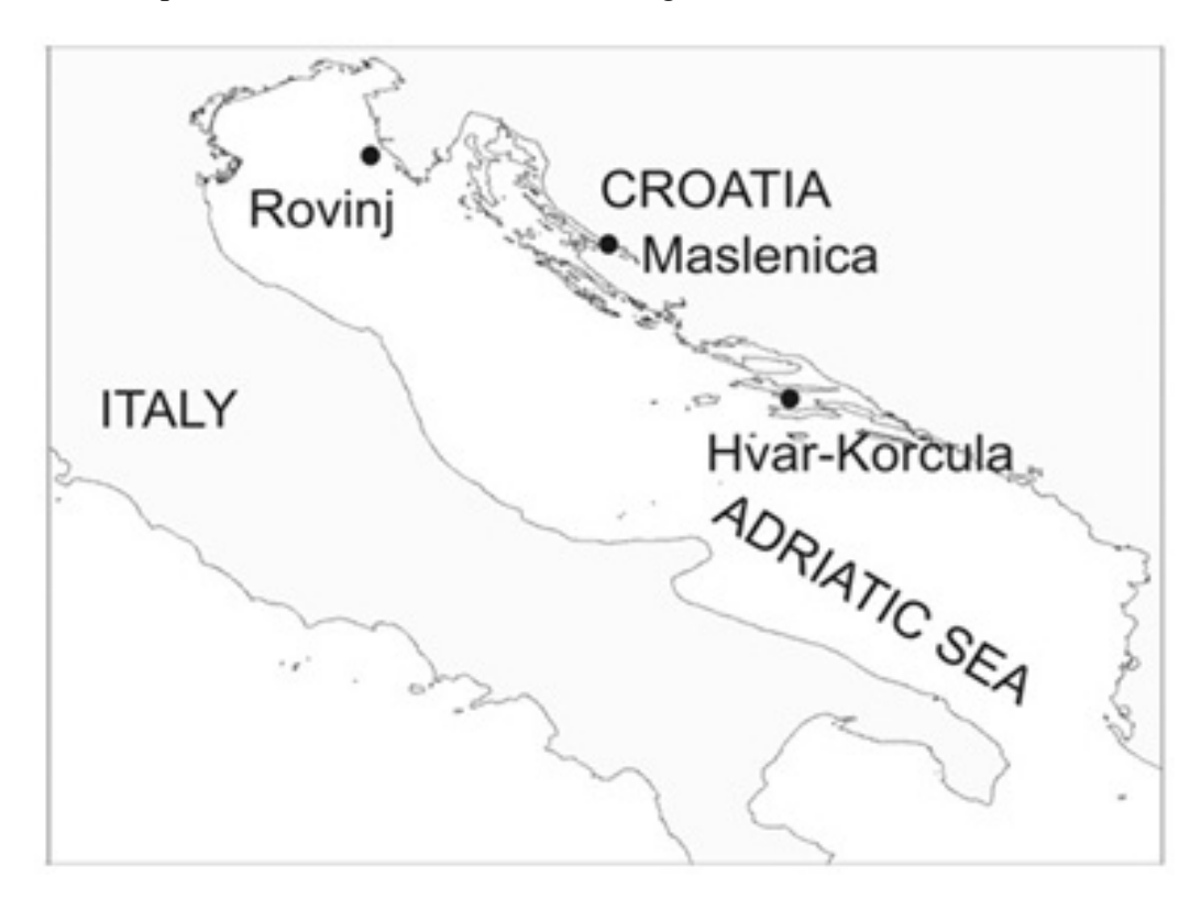
Figure 1. Map of sampling locations. Black circles indicate sampling point.

process was completed within the shortest possible time frame to avoid mixing of stocks due to migration or to obtain the same year cohort from all locations (Table 1). Tissue samples taken from 89 specimens were preserved in 95% ethanol until total genomic DNA extraction.