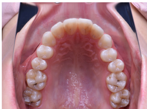
Figures 7: (a) Standardized intraoral photography of maxillary posterior dentition / occlusal surfaces (2 paraflex setup / indirect shooting by using an occlusal mirror). Both symmetrically positioned paraflexes are operational at 45° of introvert angulation. The position of the dental unit and head support should be fixed. (b) Shooting should be performed at 12 o'clock position. The dental assistant is required. (c) Intraoral occlusal photography of maxillary dentition.

Regarding the photography of the mandibular posterior dentition and occlusal surfaces, the two symmetrical paraflexes should be transferred horizontally to the middle forming a tent-shape, right above the patient's head. During the repositioning, the vertical height of the paraflexes remains stable. The clinician should stand on one side of the patient. An indirect photograph is taken by using an occlusal intraoral mirror and a C-shape transparent lip retractor (Fig. 8 a-c).