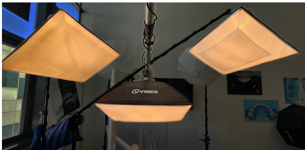
Figure 1: Recommended setup no 1 including 3 paraflashes at fixed positions above the dental unit.

The suggested intraoral photography setups may provide the standardization in intraoral photography of both anterior/posterior dentition and the occlusal surfaces at the same time clinically. Two different paraflashes / softboxes placement options are recommended above the dental unit; (1) three paraflashes are placed constantly, (2) two paraflashes are placed with the ability of simple repositioning (Fig. 1 and Fig. 2 a,b). Therefore, from now on the paraflashes softboxes can be considered indicated for also the posterior/occlusal intraoral photography through the suggested following simplified setups.