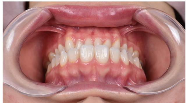
Figures 6: (a) Standardized intraoral photography of anterior dentition (2 paraflash setup / direct shooting). Both symmetrically positioned paraflashes are operational at 45° of introvert angulation. The position of the dental unit and head support should be fixed. (b) Shooting should be performed at 12 o'clock position. The dental assistant is not required. (c) Intraoral frontal photography of anterior dentition.

Regarding the photography of the maxillary posterior dentition and occlusal surfaces, the two symmetrical paraflashes should be transferred horizontally to the middle forming a tent-shape, right above the patient's head. During the repositioning, the vertical height of the paraflashes remains stable. The clinician should stand at the 12 o'clock position. An indirect photograph is taken by using an occlusal intraoral mirror and a C-shape transparent lip retractor (Fig. 7 a-c).