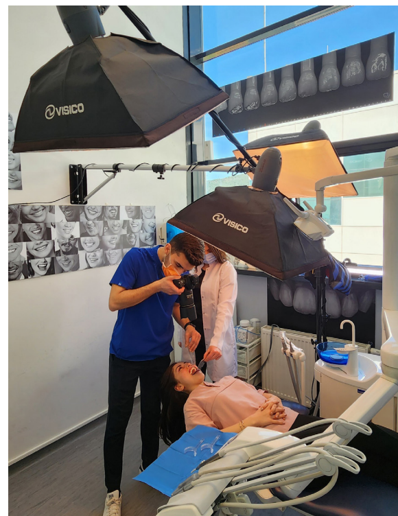
Figures 3: (a) Standardized intraoral photography of anterior dentition with (3 paraflash setup / direct shooting). Only two symmetrical paraflashes are operational at 45° of angulation. The position of the dental unit and head support should be fixed. (b) Shooting should be performed at 12 o'clock position. The dental assistant is not required. (c) Intraoral frontal photography of anterior dentition.

Regarding the photography of the maxillary posterior dentition and occlusal surfaces, all three paraflashes should be operational. The clinician should stand at 12 o'clock position. An indirect photograph is taken by using an occlusal intraoral mirror and a C-shape transparent lip retractor (Fig. 4 a-c) (McLaren & Terry, 2001).