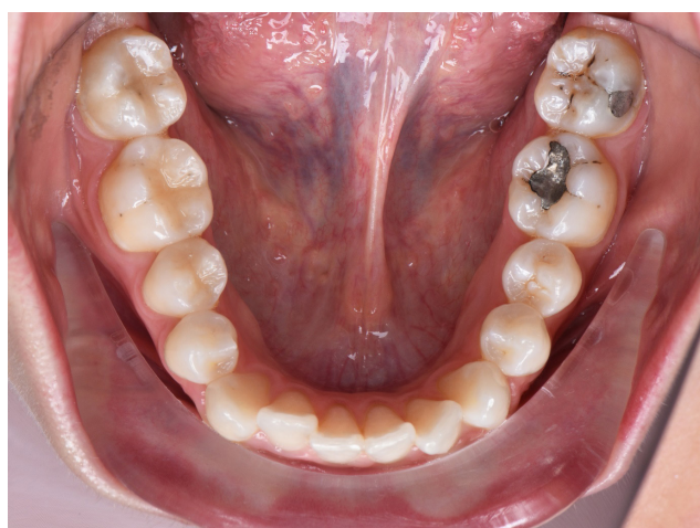
Figures 5: (a) Standardized intraoral photography of mandibular posterior dentition / occlusal surfaces (3 parafash setup / indirect shooting by using an occlusal mirror). The third parafash is turned on and all three parafashes are operational. (b) Shooting should be performed at the side of the patient. The position of the dental unit and head support should be fixed. The dental assistant is required. (c) Intraoral occlusal photography of mandibular dentition.