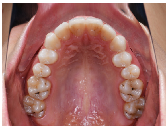
Figures 4: (a) Standardized intraoral photography of maxillary posterior dentition / occlusal surfaces (3 parafash setup / indirect shooting by using an occlusal mirror). Third parafash is turned on and all three parafashes are operational. The position of the dental unit and head support should be fixed. (b) Shooting should be performed at 12 o'clock position. The dental assistant is required (Korkut B, 2022). (c) Intraoral occlusal photography of maxillary dentition.

Regarding the photography of the mandibular posterior dentition and occlusal surfaces, all three parafashes should be operational. The clinician should stand on one side of the patient. An indirect photograph is taken by using an occlusal intraoral mirror and a C-shape transparent lip retractor (Fig. 5 a-c).