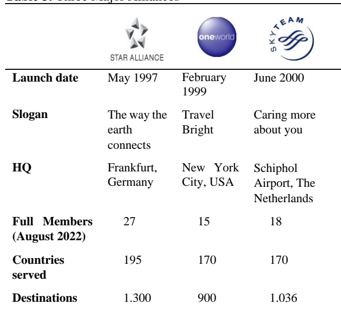
Table 3. Three Major Alliances

Source: https://www.staralliance.com , https://www.oneworld.com/ , https://www.skyteam.com