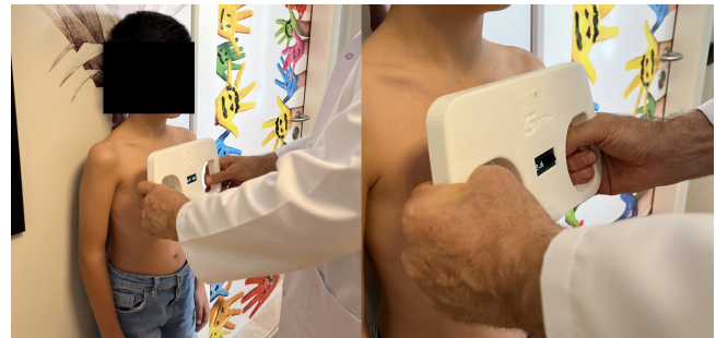
Figure 1. Images demonstrate the use of measurement device for identifying the pressure for initial correction (PIC). This pressure is measured when the patient standing with the back against a wall.

we only recommended them to wear the brace if the deformity starts to reoccur. This phase lasts 2 to 22 months. If there was no improvement or insufficient improvement of the deformity after 6 to 12 months of treatment, we stop CEB and recommend Abramson procedure for optimum correction. Figure 2 shows the application of specific designed custom-made compressive external bracing.