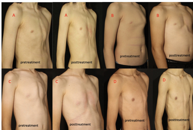
Figure 3. Pre and post-treatment images of some of the patients. A. A 13-year-old male patient before and after application of CEB B. An 11-year-old male patient before and after application of CEB C. A 12-year-old male patient before and after application of CEB D. A 16-year-old male patient before and after application of CEB.

We had 52 patients (52 %) in the active phase of treatment, while 24 (24 %) were in the maintenance phase. In addition to that, we had 24 patients (24%) who had completed treatment after a mean treatment time of 16 months (range, 9 to 28 months). No recurrences were detected in the whole series, and we did not have any patients who abandoned or had problems with compliance. Although younger patients had tendency to not to wear as planned, they got better results in a shorter time than the older patients. 23 (23%) patients had scoliosis, 9 (9%) had kyphosis, 1 (1%) had Poland Syndrome and 1 (1%) patient had Marfan Syndrome as accompanying anomalies. The patient with Marfan Syndrome had a history of right thoracotomy due to aortic coarctation operation. Additionally, 46 (46%) of the patients had flaring ribs bilaterally which were treated with specially designed rib bandages along with CEB if they are younger than 16 years old. If bandages did not help in correcting the rib flares, we recommended custom-made rib flare braces as we did in the adult population. For patients who were older than 16 years we did not use bandages and preferred custom-made rib flare braces initially. Figure 3 demonstrates pre – and post-treatment pictures of some of our patients.