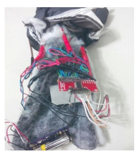
Figure 1: Parts of the glove [Upper part of the glove (16-Channel Analog/Digital Multiplexer and AAA battery unit)]