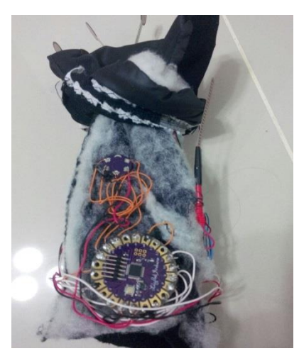
Figure 2: Parts of the glove [Lower part of the glove (Lilyaped, ADXL335, Flex and force sensors)]

Arduino IDE, which is a code editor and compiler written in Java programming language, was used to operate the sensors and control the microcontroller in the project. Unity software was preferred to perform the smart glasses application while Vuforia SDK was preferred for the AR application.