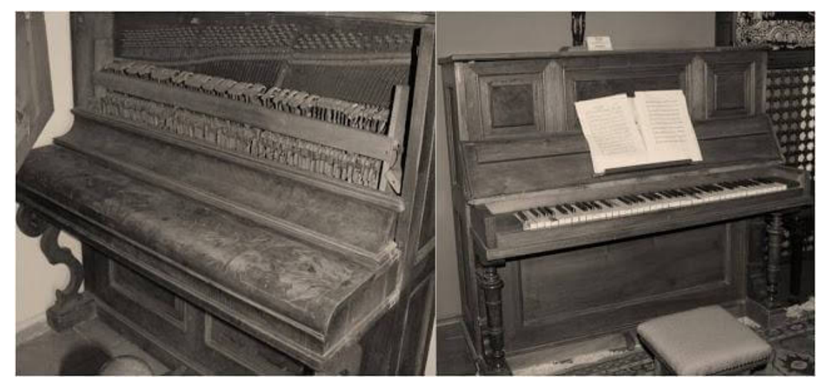
Photo 5. A piano made by Mehmet Efendi at the Governor's Mansion in Kastamonu (Can, 2019)