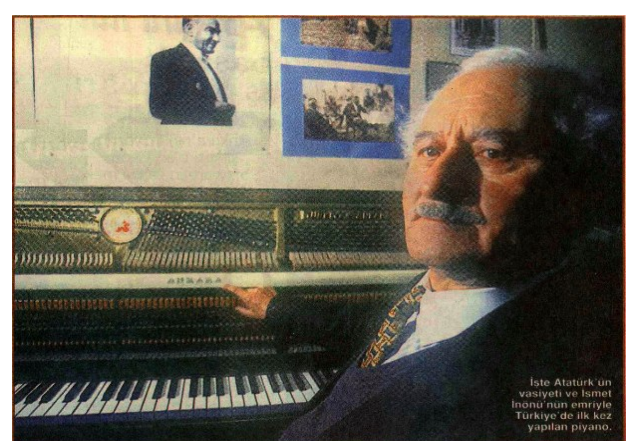
Photo2. The first piano in Turkiye (Can, 2019)