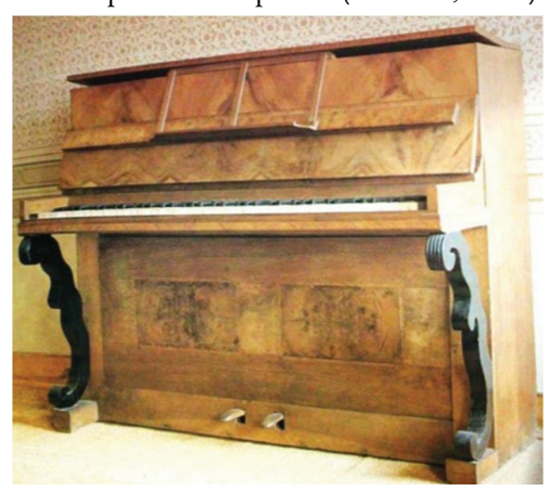
Photo 1. A piano made in the palace by Taşköprülü Mehmet Usta (Can, 2019)

As the music market in Istanbul developed, playing the piano became an important pastime among Ottoman ladies as a sign of the alafranga culture. Although it was seen as limited to lessons and performances in the homes of families from certain socio-economic classes, piano education even entered the curriculum of some state schools. The decorative feature of the piano, which was both an educational and performance tool, made it a multifunctional material element of Ottoman mansion life. This interest in the piano is closely related to the demand of the European middle class for this instrument, which led to mass production of pianos for a period (Alimdar, 2016).