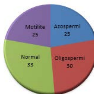
Figure 2. Distribution of infertile patients by groups

When the volumes are examined, the right testicular and left testicular volume values of the groups show a statistically significant difference ( p < 0.05 ). The right and left testicular volume values of the azoospermia group are statistically different and lower than the other groups ( p = 0.001 ). The right volume values of the oligospermia group were found to be statistically lower than the normal and motility disorder groups, but higher than the azoospermia group (Table 1).