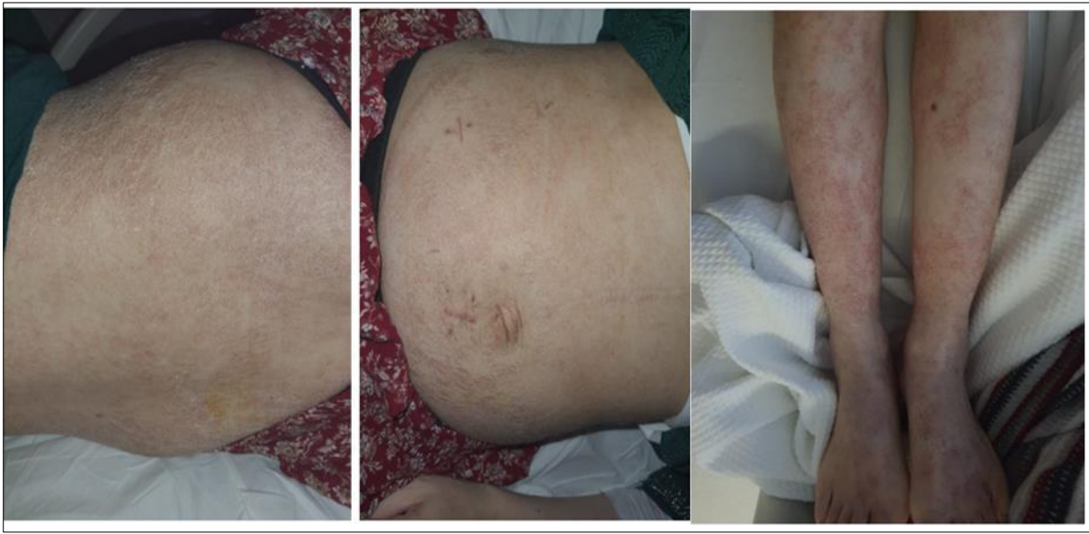
Figure 1. Skin lesion.

In the detailed anamnesis, the patient was married, a mother of one child, lived in a rural area, and had no family history other than hypertension in her father. In the system query, she lost approximately 10 kilos in the last 4 months, had fever and rash attacks during this period but the fever and rash attacks were not related. On physical examination, body temperature: 37.8 °C, pulse: 98/min, blood pressure: 116/73 mmHg, respiration rate: 16/min, traube's space was closed. There were widespread, patchy, salmon-coloured, macular and dandruff looking lesions on the skin of back, abdomen and legs (Figure 1).