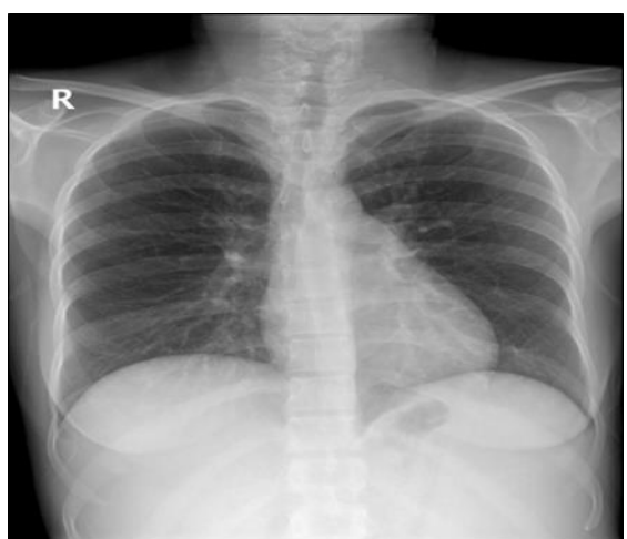
Figure 3. Skin lesions after treatment.

of extrapulmonary sarcoidosis. The skin rash was observed to regress after treatment (Figure 3).