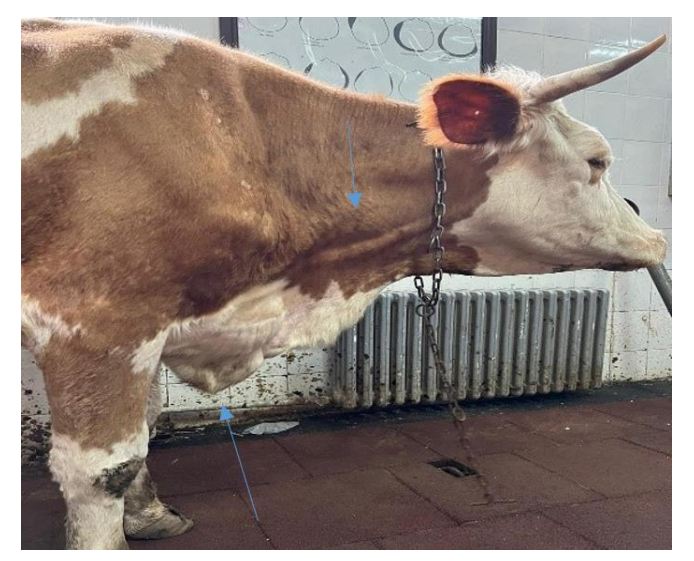
Figure 1. Show the edema and positive venous pulse in the gerd region of cows from the PT group of the present study

swelling in the ventral part of the body due to circulatory failure, dull sound on percussion of the heart and rhythm disturbance in the heart. Figure 1 shows the edema and positive venous pulse in the gerd region of 2 cows from the PT group of the present study. The severity of the inflammation was evaluated by GLA test on cows diagnosed with RPT and PT after clinical and radiological examinations.