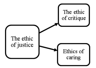
Figure 2. Model tested based on Starratt (1991)

Limitation of our study: Due to the small sample size, the results of our study cannot be generalized to the population, the Hungarian Generation Z youth or university students. However, we consider our empirical results to be significant due to the high degree of under-research on the topic.