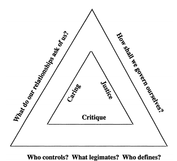
Figure 1. Structure of Starratt's model (1991, p.199)

organizational effectiveness, so people, employees, are seen more as mere means to a productivity goal. The ethic of care closes the loop of the model at this point. This factor deals with quality of life, individualism, loyalty, human dignity, and empowerment. A summary of the model is shown in Figure 1. Later Shapiro and Stefkovich (2005) suggested adding a fourth factor, the ethic of profession, which addresses the specific ethical characteristics of a given field, professional ethics and the integration of individual, personal ethical rules.